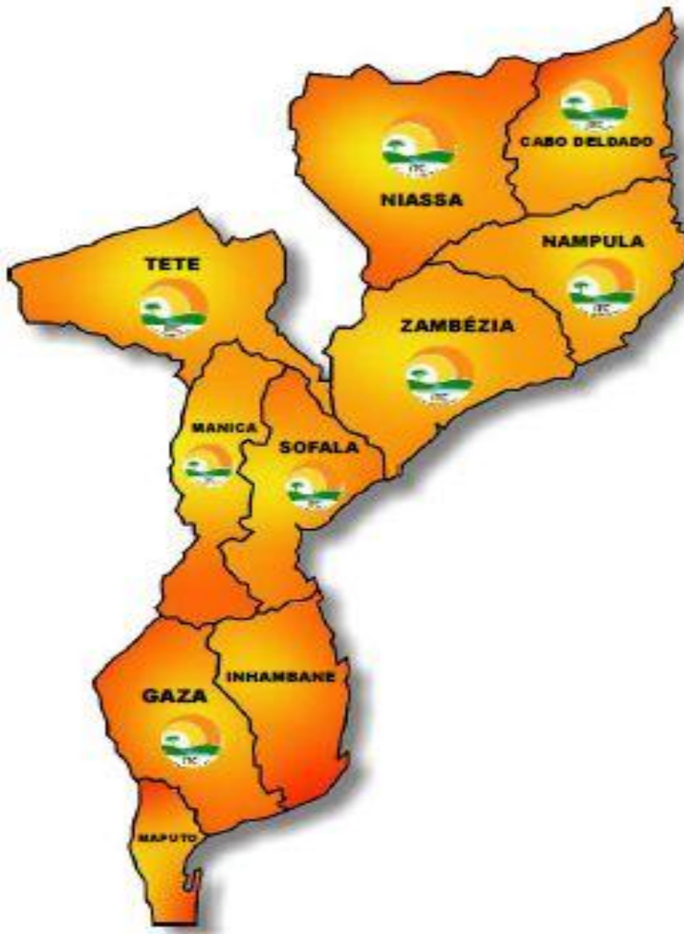
Figure 1. iTC Operational Provinces in Mozambique (2011 - 2014)