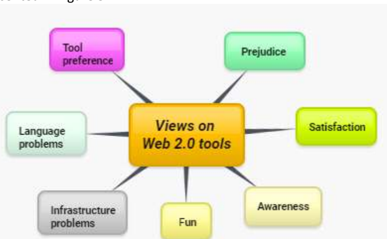
Figure 3. The Themes Determined by the Participant Views on Content Development Using Web 2.0 Tools

The present section is on the study findings related to the analysis of the data collected with the semi-structured interview form that included six questions and completed by the participants. Pre-service teachers were asked questions on the functions of the utilized tools, the facilities provided by these tools, their limitations, and the difficulties and opportunities they experienced during the content development process. Their views were grouped under seven themes. These themes are presented in Figure 3.