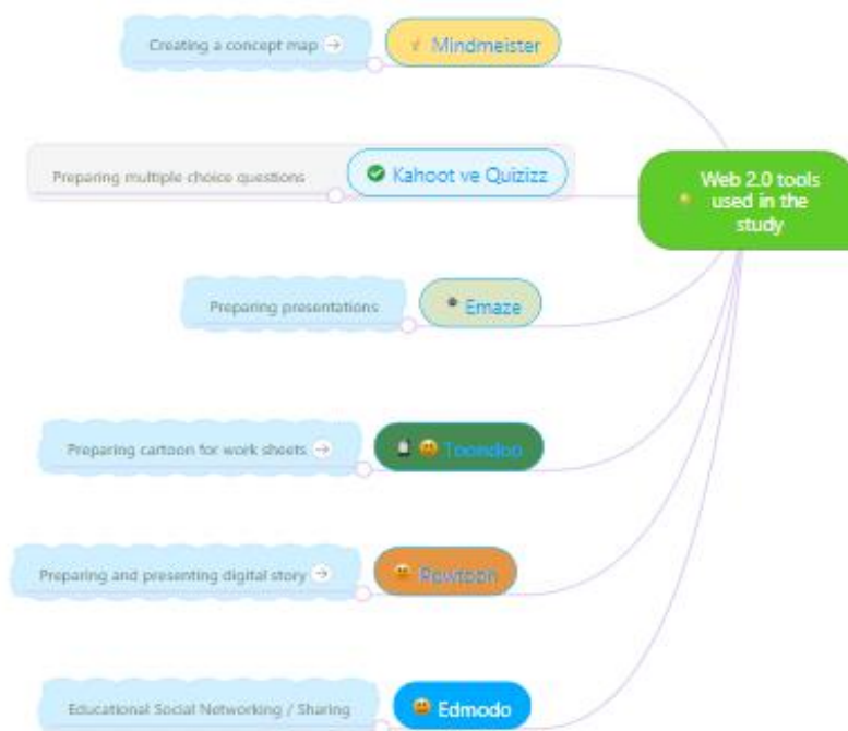
Figure 2. Web 2.0 Tools Used by Pre-service Teachers and Intended Use

During the remaining six weeks of the course, content was developed by pre-service teachers using Web 2.0 tools according to the topics determined by the researcher. Five questions related to traditional assessment techniques were prepared by Kahoot and five questions related to complementary assessment techniques were prepared by Quizizz. Powtoon to prepare animations for addressing possible validity and reliability misconceptions, Emaze to prepare presentations for subject repetition, Mindmeister for mapping the concepts of measurement and evaluation course, Tondoo to create cartoon for work sheet for test and item analysis content. The flow chart that reflects the said process is presented in Figure 2.