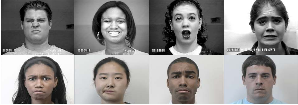
Figure 1. Examples of the CK+ database. The images on the top level are subsumed from the original CK database and those on the bottom are representative of the extended data. All up 8 emotions and 30 AUs are present in the database. Examples of the Emotion and AU labels are: (a) Disgust - AU 1+4+15+17, (b) Happy - AU 6+12+25, (c) Surprise - AU 1+2+5+25+27, (d) Fear - AU 1+4+7+20, (e) Angry - AU 4+5+15+17, (f) Contempt - AU 14, (g) Sadness - AU 1+2+4+15+17, and (h) Neutral - AU0 are included.