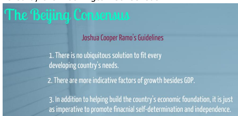
Picture 2. Three guidelines from the Beijing Consensus (Hubner, 2013)

The rise of China as the new economic super power has contributed to the change of the international economic architecture. China role in terms of economy has challenged the position of the United States as the most dominant player at the international level (Albertoni & Arguello, 2015). Its increasing development has decreased the influence of the United States, especially among the developing countries (Turin, 2010). Therefore, many people are now discussing a new economic term called "Beijing Consensus." The Beijing Consensus was firstly introduced by Joshua Cooper Ramo in 2004 through his paper published by the United Kingdom's Foreign Policy. Ramo sees that the economic policies produced in Beijing have become concern for many countries and influence the international economic architecture. The Chinese economic model/ Beijing Consensus offers a different model and characteristic than the guidelines offered by the Washington Consensus.