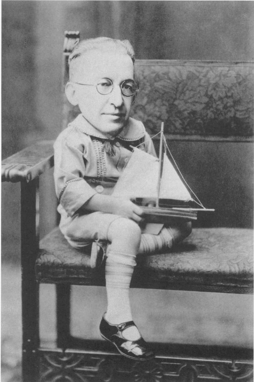
FIGURE 1. Purdy, Photomontage of Man's Head on Boy's Body, c. 1915.