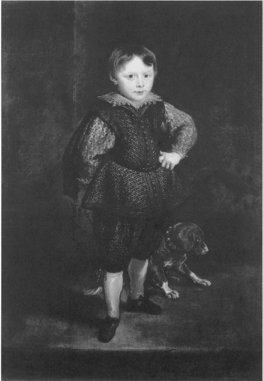
FIGURE 2. Sir Anthony van Dyck, Filippo Cattaneo, Son of Marchesa Elena Grimaldi , 1623. Oil on canvas. Widener Collection, National Gallery of Art, Washington, D.C.