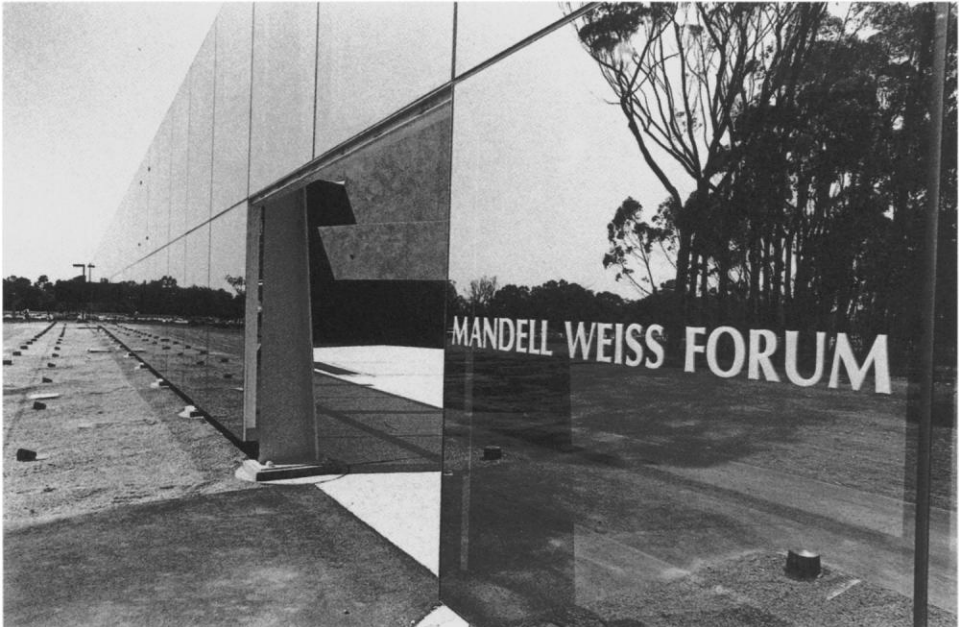
FIGURE 4. Mandell Weiss Forum, University of California, San Diego.

self-possession. The result is a moment, trivial or devastating, in which the cocoon of seeing and being seen falls away. The loss of self you abruptly rediscover at such moments is one version of the phantasmatic event psychoanalysis calls the trauma.