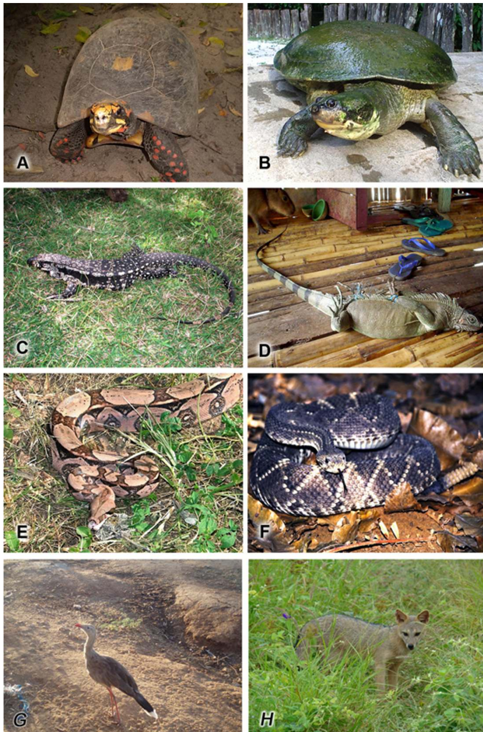
Figure 2 Examples of animals used as medicine in Latin America. A - Chelonoidis carbonaria , B - Podocnemis expansa , C - Tupinambis merianae , D - Iguana iguana , E - Boa constrictor , F - Caudisona durissa , G - Cariama cristata , H - Cerdocyon thous .

It is worth mentioning that such “natural modeling” does not necessarily preclude empirical efficacy. In Oxchuc, México, the two most common medicines given to speed delivery in cases of protracted labor are