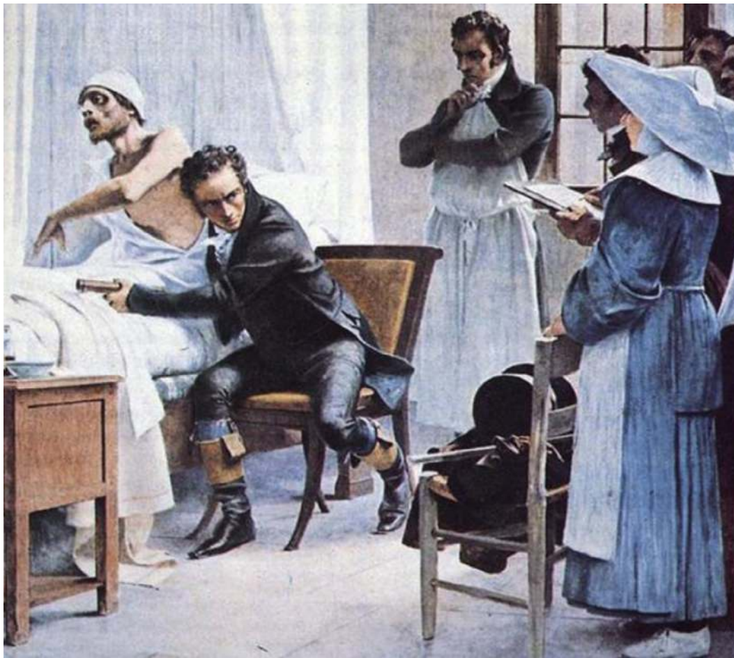
Figure 2 Laënnec at the bedside performing direct auscultation.

Notes: Image from the U.S. National Library of Medicine. Painting by Théobald Chartran (1849–1907).