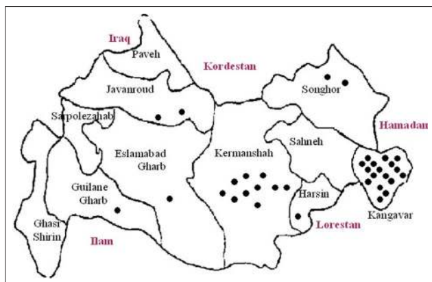
Figure 1: Distribution of human fascioliasis in Kangavar (N=17) and other areas o Kermanshah province (N=17), Iran, Spring 1999

The serum samples which were sent to Pasteur Institute and of Health at Tehran University approved the existence of anti- Fasciola hepatica antibodies by means of IFA, ELISA, and CCIE tests. It's worth noticing that diagnosis of the disease in this stage is only possible through serological tests. In other words, the serological tests are useful during acute infection because symptoms develop one to two months before eggs