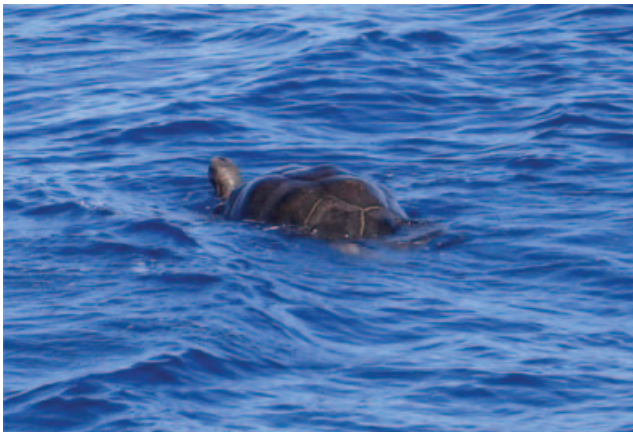
Figure 3. Aldabra tortoise at sea off Alphonse in December 2005.

It seems that the tortoise had escaped from the enclosure some time before. In its wanderings it must have ended up on the beach or on the reef flat at low tide and