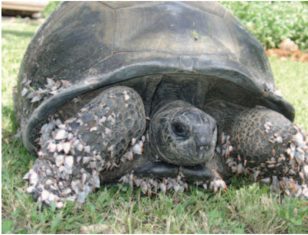
Figure 1. The Aldabra tortoise at Kimbiji, shortly after its discovery in December 2004.

wide (curved carapace measurements) and was taken to a breeding centre in Dar es Salaam (measurements were taken in December 2004). After 3 months, the tortoise had gained 2 kg.