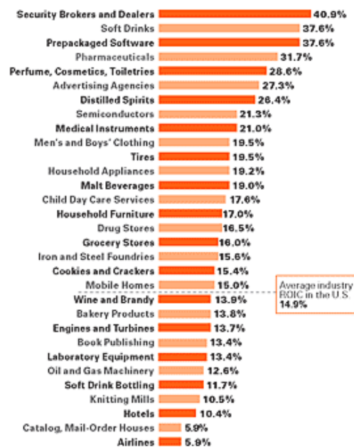
Profitability of Selected U.S. Industries Average ROIC, 1992–2006

Source: Standard & Poor's, Compustat, and author's calculations