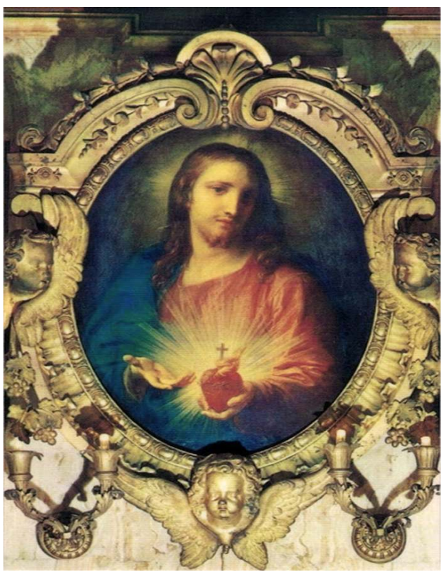
Fig. 3: Pompeo Batoni, The Sacred Heart of Jesus , oil on copper, 1767, Church of Il Gesù, Rome

During the pontificate of Clement XIV (1769-1774) the process leading toward official papal approval of the devotion came to an impasse. The Pope had to deal with the growing opposition to the Society of Jesus expressed by the European monarchies. The history of the Sacred Heart was therefore linked to the mixed fortunes of the religious order that had done the most to promote and spread the devotion.