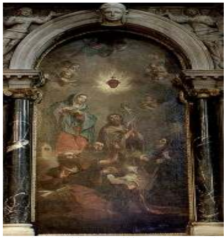
Fig. 4: Bartolomeo Letterini, Madonna Addolorata con il sacro cuore di Gesù , oil on canvas, 1730, Church of San Canciano, Venice

around 1755 at Lendinara (Patria del Friuli), that the Sacred Heart of Jesus emerged as a devotion to Christ.<sup>71</sup> The heart, isolated and encircled by a crown of thorns, appeared not "to counterbalance the powerful presence of the female saint" but rather to share the pictorial space with the saint.<sup>72</sup> The nuns were devoted to the heart, and that was the object of the painting (along with Saint Agatha). This was a device that allowed Tiepolo to paint the Sacred Heart as a separate organ, yet with a link to an established holy image. The heart was painted at the top of the canvas, on a smaller movable lunette that later mysteriously was lost and has now disappeared.