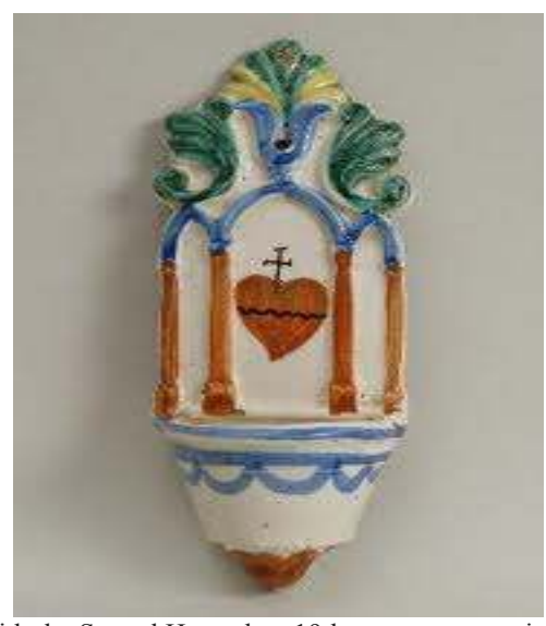
Fig. 6: Domestic holy water stoup with the Sacred Heart, late 19th century, ceramic, Museo Etnografico, Udine. Ex-votos were not the only objects which the devout could employ to venerate the heart. Religious items in the shape of a heart were widely produced in the eighteenth century and after. Reliquaries, medals, pendants, scapulars, stoups, and all sorts of religious paraphernalia in the shape of heart became highly popular in churches and in domestic settings, as well as in private usage.

The fleshy heart still resonates with current spirituality; moreover, in Italy the heart still appears in public exhibitions. In Cividale del Friuli in April 2006, the local religious and secular institutions brought the Sacred Heart to the fore again by launching an art contest. Needless to say, the artists' approach to the devotion was varied but mainly focused on the heart. Significantly, the exhibition explored multiple possibilities for depicting the heart, and included images in which the heart both revealed and transcended its materiality. Hence, the battle over the iconographical depiction of the heart remains unfinished even today, because the heart keeps fluctuating between the fleshy muscle that is and the spiritual to which it is pointing . Given the impossibility of "freezing" the Sacred Heart, we may speculate that the needs which characterized late medieval theology, that is "the paradoxical need to restrain (sometimes to the point of denying) and yet utilize (sometimes to the point of exaggerating) the transformative power of the material," are still present in modern society. 134