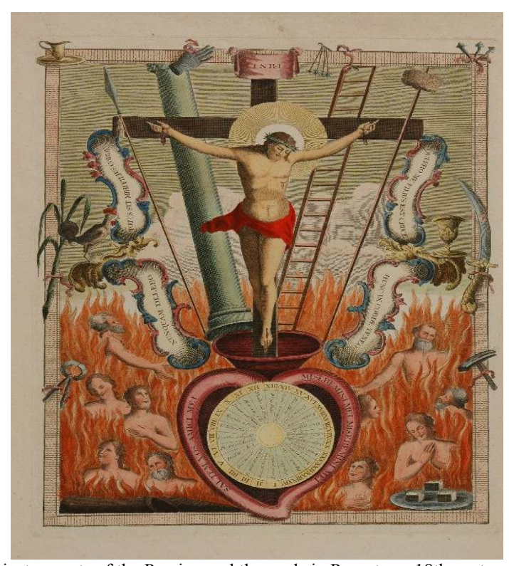
Fig. 7: Christ Crucified with instruments of the Passion and the souls in Purgatory, 18th century, Remondini, Bulino engraving, Museo Etnografico, Udine. This busy and crowded scene seems to be an iconographical attempt to depict the Sacred Heart as almost disguised by other, more established and recognizable symbols of devotion. The Remondinis merged in one image instruments of the Passion, emerging bodies of penitents from a sea of flames, and the heart of Jesus. The heart sits at the feet of the crucified Christ; it is depicted in a funnel shape and seems to draw into itself not only Christ, but also the rest of the scene. All of the traditional signs of the Man of Sorrow(s) ultimately dissolve into the heart. Thus the prior emphasis on an act of Atonement for sin switches to a tribute to the heart that encompasses all.

However, this was a process of accumulation rather than a process of exclusion. The people retained their saints, or at least some of them, and at the same time they incorporated the devotion of the heart. The heart was therefore not merely replacing the saints; rather, it enriched the panoply of devotional choices, addressed another dimension of human spiritual life, and fulfilled a different category of needs. The increasing presence of the heart of Jesus did not push away or marginalize the cherished saints, but it did very successfully re-emphasize a Christocentric focus in Catholic piety.