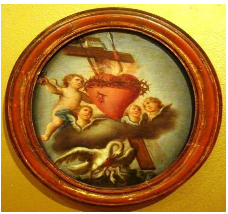
Fig. 2: Sacred Heart with Crown of Thorns, painting, Radio Spada iconographic gallery dedicated to the cult of the Sacred Heart. Accessed February 27, 2014, http://radiospada.org

They explained that the new devotion was aggressively penetrating the religious landscape: indulgences were granted, confraternities were formed, and new prayers, orations, and rituals were either added to the old ones or else completely replaced them. <sup>50</sup> Even the old liturgy was giving way to new and unsettling ceremonies. Leaflets and devotional books containing images of the Sacred Heart of Jesus were being published and distributed within as well as outside of new religious groups; convent choruses were adorned with statues devoted to the new cult; and nuns' cells were filled with devotional objects carved in the shape of hearts. These ways of introducing new iconographical motifs into the catalogue of religious imagery were unprecedented and unsettling. <sup>51</sup>