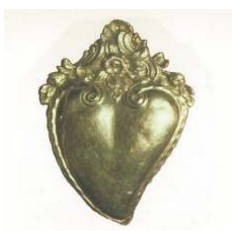
Fig. 5: Heart-shaped ex-voto in gold, 18th century, Italy. Elisabetta Gulli Grigioni, I cuori della Madonna: il simbolo del cuore in oggetti e immagini della devozione mariana dal Seicento alla prima metà del Novecento (Ravenna: Essegi, 1997), 29

The Sacred Heart of Jesus, as its eighteenth-century opponents had feared, invasively and aggressively made a place for itself. Not only did it become the iconic image of Catholicism in the world, but by virtue of its evocative representations it shaped and articulated religious identity. Did the Sacred Heart reach its current form in the twentieth century, as some historians claim, having slowly but progressively left its bodily shape behind? While majestic statues of Christ adorn the most recent cathedrals dedicated to the devotion of the Sacred Heart, and the heart is no more than a symbol expressed in gesture, in Italy as well as in other Catholic countries religious enthusiasm for ex-votos , emblems, and devotional objects in the shape of hearts has not abated (Fig. 6). In the realm of private devotion, the Sacred Heart still assertively displays its original bodily matter.