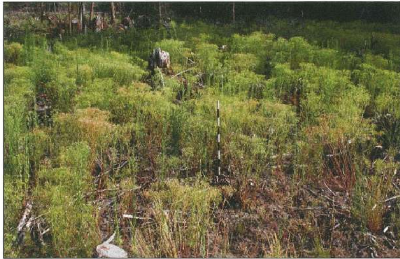
Figure 4. Early-successional communities are often dominated by annual herbaceous species for the first few years after disturbance; these are quickly displaced by perennial herbaceous species and shrubs.

Small mammal communities in ESFEs typically show high levels of diversity as well, including some obvious habitat specialists. The eastern chestnut mouse ( Pseudomys gracilicaudatus ), for example, inhabits early-successional environments in coastal eastern Australia for 2-5 years after a wildfire, and then declines dramatically until these environments are burned again (Fox 1990). Populations of mesopredators (medium-sized predators, such as raccoons [ Procyon lotor ] and fox species) benefit from the abundance of small vertebrate prey items characteristic of ESFEs. Likewise, some species