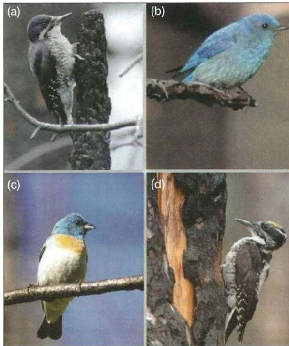
Figure 5. Bird diversity is typically high in early-successional communities on forest sites and includes many habitat specialists: (a) black-backed woodpeckers ( Picoides arcticus ) are almost entirely restricted to early post-fire habitat; (b) mountain bluebirds ( Sialia currucoides ) favor early-successional ecosystems; (c) lazuli buntings ( Passerina amoena ) and (d) three-toed woodpeckers ( Picoides tridactylus ) have similar requirements.

successional context (Minshall 2003; Figure 6). This greatly diversifies the types and timing of allochthonous inputs, as well as increases primary productivity. Allochthonous inputs are shifted from primarily tree-derived litter (coniferous-based in many systems) to material from a range of flowering herbs, shrubs, and trees, as well as from conifers. Consequently, litter inputs are highly variable in quality (eg decomposability) and delivery time, as compared with litter-fall contributed primarily by evergreen conifer species. Also, inputs to post-disturbance streams often include material with a high nitrogen content, such as litter from the early-successional genera Alnus and Ceanothus (Hibbs et al. 1994).