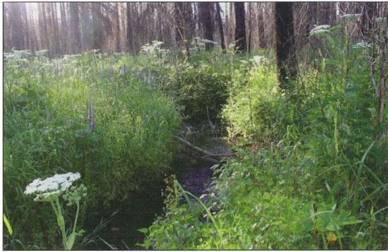
Figure 6. Streams within early-successional forest ecosystems contrast with forest-dominated reaches in many ecosystem attributes, including physical parameters (temperature and insolation), structure, plant and animal composition, and ecosystem processes, such as primary productivity.

Rates and patterns of geomorphic processes, such as erosion and nutrient leaching losses, are also different between ESFEs and later successional stages. Tree death results in a loss of root strength that is critical for stabilizing soils and deeper rock layers on mountain slopes (Perry et al. 2008). Erosion and landslides may occur at higher rates in ESFEs, contributing to the variability of sediment budgets in watersheds (Reeves et al. 1995) and creating long-lasting substrates for ruderals. While enhancing erosion processes, ESFEs also provide materials and processes that counteract this effect, such as woody debris, which retain sediments and organic materials, and surviving vegetation, which stabilizes slopes and nutrient stores (eg Bormann and Likens 1979).