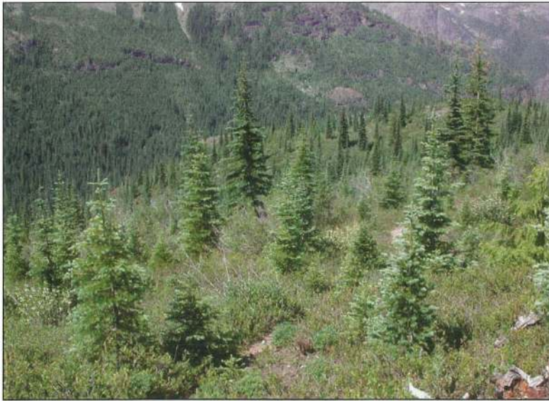
Figure 1. Stand-replacement disturbance events in forests create large areas free of tree dominance and rich in physical and biological resources, including legacies of the pre-disturbance ecosystem.