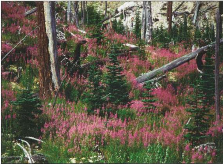
Figure 3. Plant communities with well-developed shrub and perennial herb species are characteristic of early-successional communities on forest sites and provide diverse food resources. Twenty-five years after the Mount St Helens eruption in 1980, this community, which was within the blast zone, includes well-developed shrubs (eg Sorbus and Vaccinium spp), trees, and perennial herbs (eg Epilobium angustifolium ).

Structural complexity is further enhanced by the establishment and development of a variety of plant species, which often include perennial herbs and shrubs characteristic of open environments, as well as individual trees (Figure 3). The diversity of plant morphologies (maximum height, crown width, etc) increases structural richness, so that this associated flora contributes to both horizontal and vertical heterogeneity.