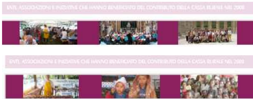
Figure 5. An example of some of the pictures that generate an accumulated repetition in which more than two devices have been used to repeat the same concepts (See Table 1). In this case the bank associates these and other pictures to a table, a drawing and to a detailed narrative explanation of the bank social intervention plus a list of all social interventions. In this case multiple devices (the narrative explanation plus the list, plus the table, plus the drawing, plus the pictures) have been used to express the same concept: the bank's social interventions exploiting the possibility of acting on a multiple source of stimuli (Anderson 2000; Mayer and Massa 2003; Mancina 2006) but incurring a risk of superfluity or excess (Lothian 1976).