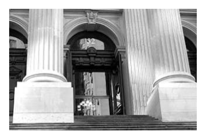
NYC Museum School: New York, New York

The New York City Museum School The 400 high-school students at the NYC Museum School (http://schools.nyc.gov/SchoolPortals/02/M414/default.htm) spend up to three days a