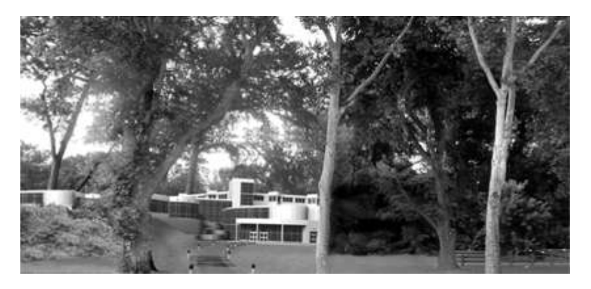
The School of the Future: Philadelphia, Pennsylvania. Image of the School of the Future

schedules and locations change every day (the goal being to break down our culture's dependency on time and place), and all rooms are designed with flexible floor plans to foster teamwork and project-based learning. Instead of a library and text-books all students are given a laptop with wireless access to the Interactive Learning Center, the school's hub for interactive educational material. These laptops are linked to SMARTBoards in every classroom and networked so that assignments and notes can be accessed even from home. The building itself is also unique in its holistic approach. Rainwater is caught and repurposed for use in toilets, the roof is covered with vegetation to shield it from ultraviolet rays, panels embedded within the windows capture light and transform it into energy, room settings auto-adjust based on natural lighting and atmospheric