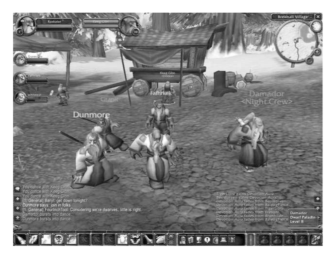
Screenshot from World of Warcraft

Massively Multiplayer Online Games are attracting scholarly attention as an important social phenomenon. Games such as World of Warcraft offer alternative worlds where social functions, learning, and the development of social, tactical, and work skills can be practiced in a virtual environment. Researchers are also beginning to look at these games as a way to study model societies and social interactions.