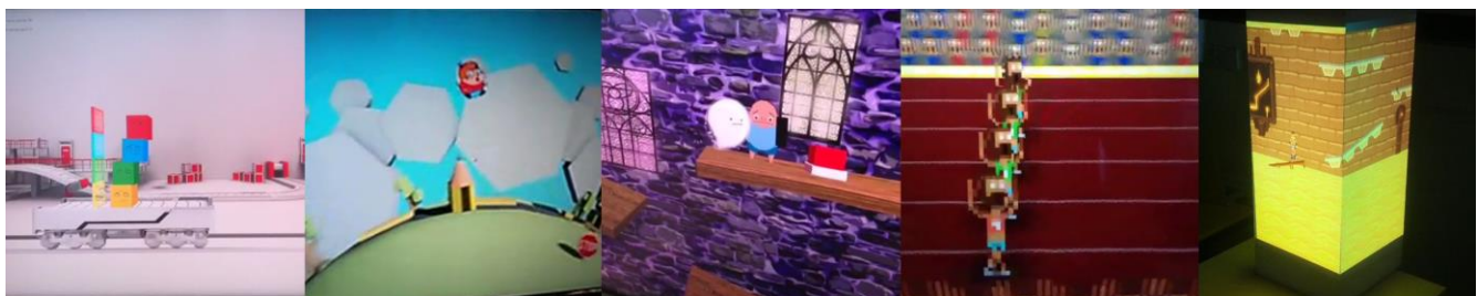
Figure 2: Screenshots from games produced at the jam from left to right: “Jump Star” a four player co-operative stacking game; “The Boy who Couldn't” a Leap Motion game where players have to bounce the character to avoid obstacles; “Castle Freak” a scaring game which uses the player's voice as an input; “Accelerunner”, a four player running simulator; “Phoenix Down”, a three player tower climbing game on a real tower.

The jump jam was designed to not only allow for experimentation and improvisation but also to facilitate community development, thus, the schedule was designed to include a number of social events including an introductory meet and greet, a social mixing event after the first evening and an arcade and awards event at the