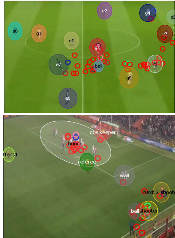
Figure 2: Dynamic AOIs for two frames from the passing scene (top) and the free kick scene (bottom). Filled circles and ellipses denote the dynamic AOIs. The smaller bold rings represent the fixations of amateurs, novices (both red), and professional soccer players (blue, green).