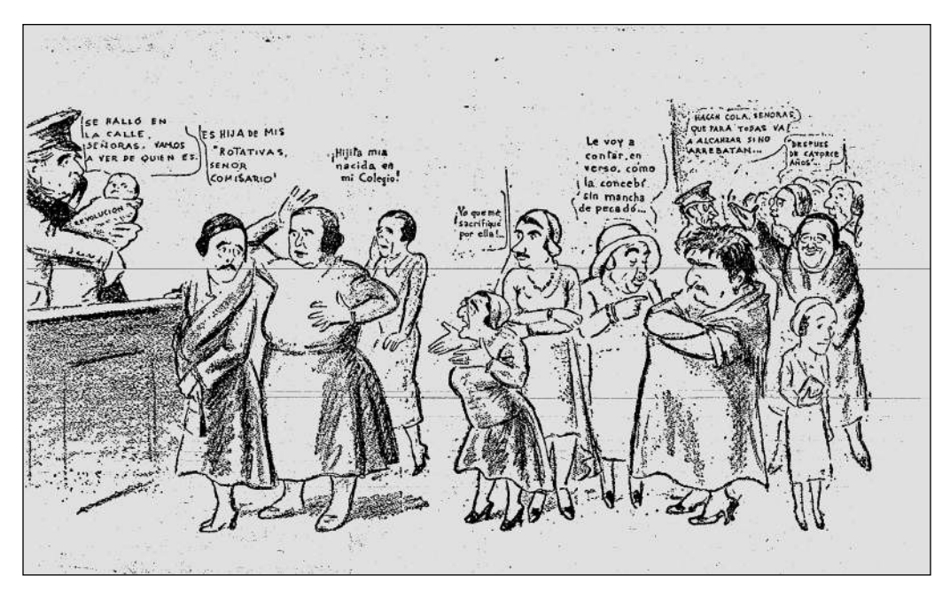
Fig. 1. Páginas de Columba, Sept. 1930.

is listed in the UCLA and New York Public Libraries (widely accepted to be Pynchon's primary research hubs during this period).<sup>37</sup>