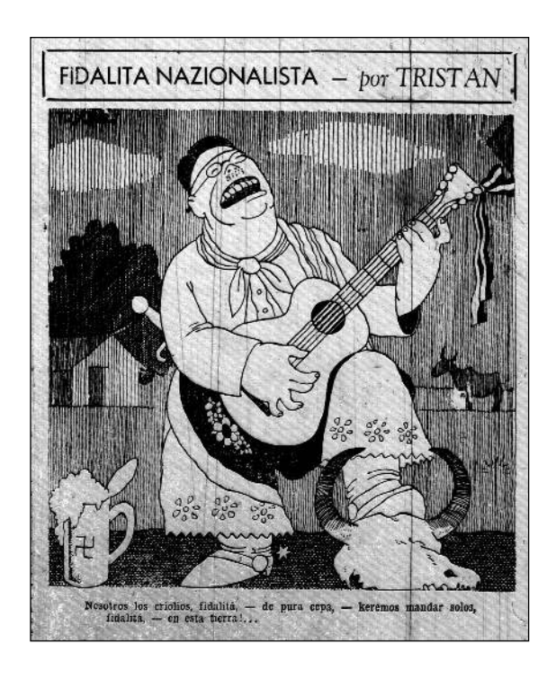
Fig. 2. Alerta! 22 Oct 1940.