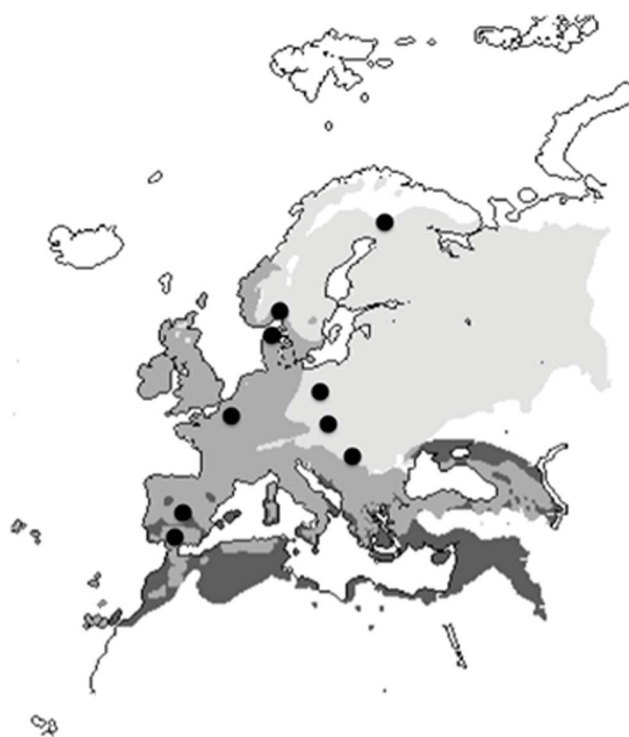
Figure 1. Location of the nine study sites for FID in Europe. Major climatic zones (subtropical, temperate and continental-subarctic, from darker to lighter shading) are also shown. For latitudes and city names see Table S1.

The objective of this study was to test for the existence and predictors of a latitudinal trend in FID of birds when being approached by a human, taken here as a methodologically proper surrogate for the risk of predation experienced by bird populations. We studied FIDs at nine different pairs of nearby rural and urban sites along a latitudinal gradient from Southern Spain to Northern Finland (Figure 1), allowing for repeated tests among independent populations within species. Bird census data from these sites [35] were used to test whether raptor abundance showed a similar latitudinal gradient. Because FID differs consistently between rural and urban populations [32,33], we also tested if the latitudinal trend was consistent independently of habitat. Finally, we tested whether latitudinal gradients in FID were related to parallel gradients in raptor abundance. Overall, our main aim was to test whether different bird species showed consistent latitudinal patterns of anti-predator behavior in relation to spatial patterns of predation risk. If that was the case, this would be the first empirical documentation of such a latitudinal trend.