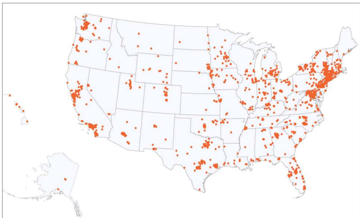
Fig. 2 Map of zip codes, representing maternal residence at time of pregnancy

One in six women (17.3%) in our sample experienced one or more types of mistreatment (Table 2). Being shouted at or scolded by a health care provider was the most commonly reported type of mistreatment (8.5%), followed by “health care providers ignoring women, refusing their request for help, or failing to respond to requests for help in a reasonable amount of time” (7.8%). Fewer women reported violation of physical privacy (5.5%), and health care providers threatening to withhold treatment or forcing them to accept treatment they did not want (4.5%). Very few women reported physical abuse, sharing of their personal information without consent, or healthcare providers threatening