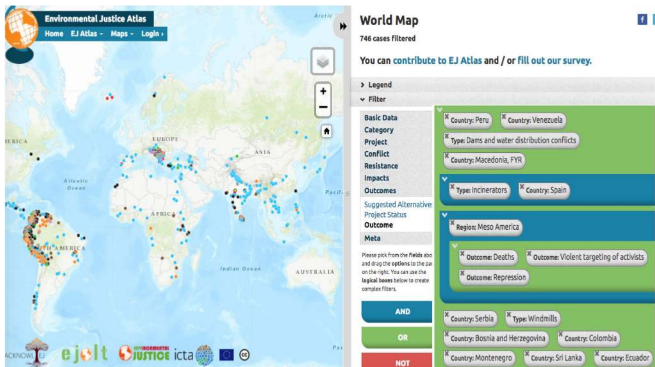
Fig. 2 The cases covered in this special feature as displayed using the EJATLAS filter tool (see ejatlas.org )