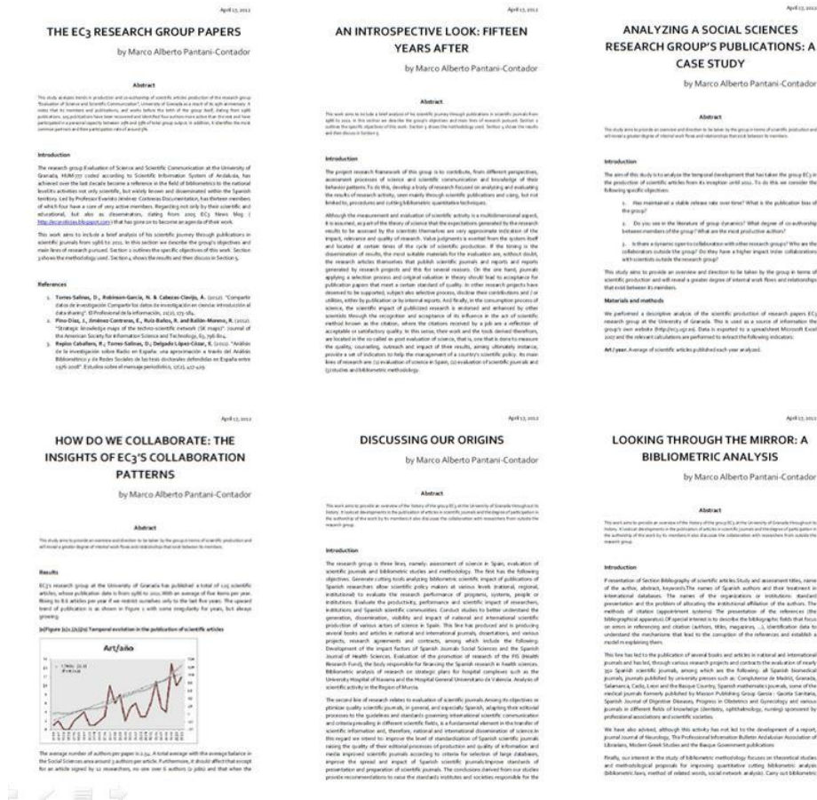
FIGURE 2. Screenshot of the publications authored by M.A. Pantani-Contador

We created a false researcher named Marco Alberto Pantani-Contador, making reference to the Italian cyclist who faced many doping allegations throughout his career and the Spanish cyclist who has also been accused several times for doping. Thus, Pantani-Contador authored six documents which did not intend to be considered as published papers but simply documents made publicly available. Each document referenced 129 papers authored by at least one member of our research group. That is, we expected a total increase of 774 citations.