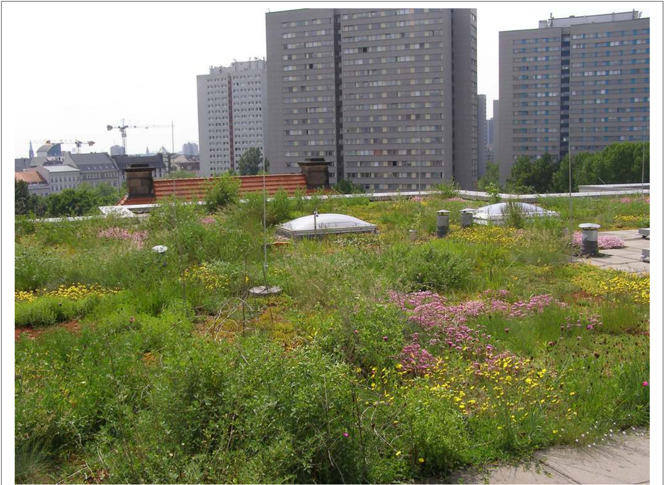
FIGURE 1 | A green roof comprised of shallow substrate and drought tolerant vegetation at the Berliner Wasserbetriebe in Berlin, Germany.

roofs (John et al., 2017). As a result, we include recommendations for research into practical components of microbial additions into green roof ecosystems including the importance of host plant specificity, the role of diversity and the mode of inoculation.