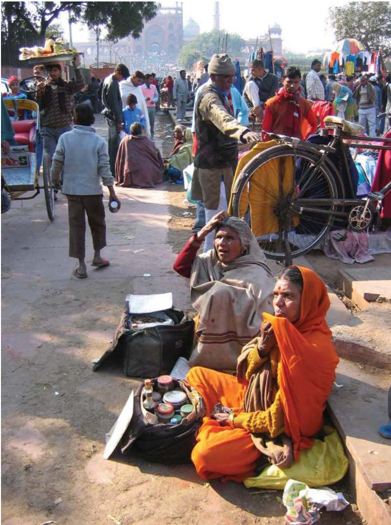
Figure 1. Hawkers of tonics for the body, Meena Bazaar, Delhi, January 2008.

Most purveyors worked in provisional and precarious conditions. Some traders inflated their stall quarters beyond the prescribed boundaries, risking demolition for ‘encroachment’. Others accumulated fines, tokens and papers from Delhi’s numerous municipal bodies, by which they argued, with varying success, for the legitimacy of their presence. Still others had manufactured counterfeit licences and depended on influential patrons to remain in business.