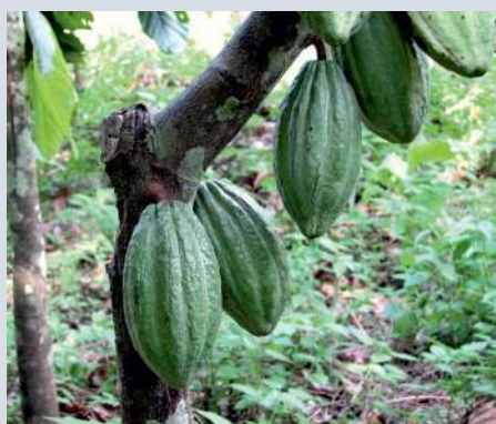
Theobroma cacao (cocoa) pods.

Although it has been argued that the perennial nature of tree crop systems makes them inherently more sustainable and less environmentally damaging in comparison with annual food crop systems (Watson, 1990), their biodiversity impacts, particularly for the production of cocoa and coffee, have increased with the expansion of plantations in many producing countries. In the case of cocoa, the total area under cultivation worldwide increased by 3 million ha (4.4 million to 7.4 ha) in the last 50 years (Clough et al., 2010), contributing to the ongoing transformation of many lowland tropical forest landscapes in Latin America, Africa and Southeast Asia that began centuries ago (Schroth and Harvey, 2007). Expansion of cocoa farms accounts for much of the deforestation in lowland West Africa (Gockowski and Sonwa, 2011) where intact tropical forests have been converted for this purpose. This transformation has been expedited by the development and introduction of highly productive cocoa hybrid varieties that require little or no forest tree shade. However, since open-grown cocoa requires increased investments in agro-chemical inputs to support optimum productivity, it has a shorter productive period