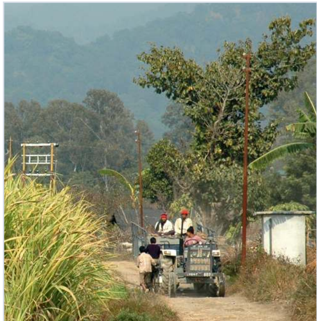
Village near Corbett National Park, India.

More research is needed into the detailed contribution of different forms of forest and tree management systems to nutrition.