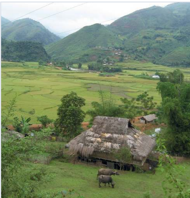
Forest and agriculture mosaic landscape, Cat Ba, Vietnam.

The nature and security of women's rights to land, trees and their products are of central importance to ensuring household food security. Gender differences in the types and relative sizes of productive assets and control of income are critical for food