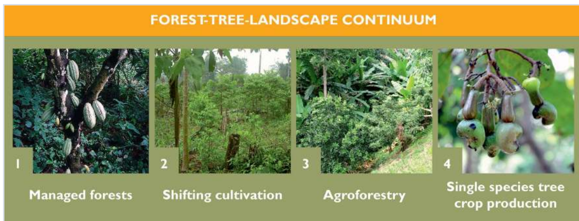
Fig. 3.1 The forest-tree-landscape continuum.