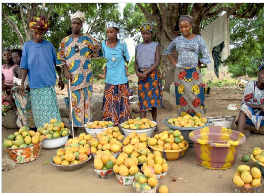
Women selling mangoes in a roadside market in Guinea.

Numerous studies cite evidence that women generally have less access to capital than men. They are often prevented by social norms or their heavy domestic and caring work from engaging in paid work outside the home or community (where wages are generally lower than in more distant, urban, jobs) and have less capacity to establish or buy tree gardens (Li, 1998). Women’s lack of financial capital is often cited as a reason for their greater dependence on common property resources, as in Ethiopia (Howard and Smith, 2006).