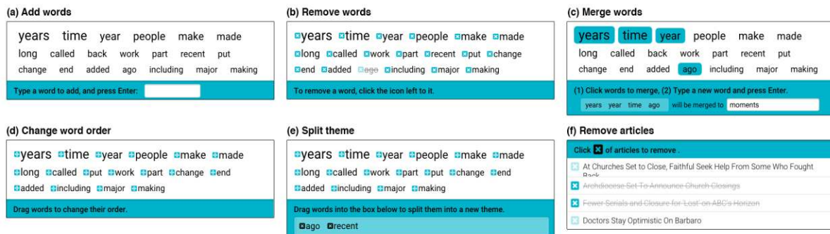
Figure 4. User interface implementation of the six refinement operations evaluated in the crowdsourced study, designed to support direct manipulation of topic words and documents. Participants had to first select an operation to view these tool details. Note that topics and documents were called “themes” and “articles” during the task.

Change word order was used in 76.7% of topics, with an average of 3.5 changes for each topic ( SD = 3.8 , Median = 2 ). Words were moved much more frequently to a higher probability position (81% of cases) than to a lower probability position. However, since participants focused on words near the top of the list (i.e., closer to rank 1), there was a significant negative correlation between the original word rank and the frequency with which a word’s order was changed (Spearman’s r_s = -.63, p < .003 ).