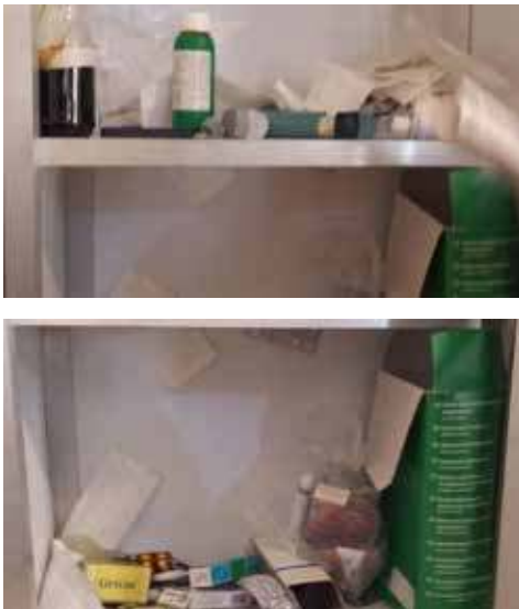
Figure 3: Medicine cabinets in the detention centre at Al Arish, the closest facility to the torture camps

The Sinai survivors who have endured so much do not necessarily complain much in the detention centres. However, conditions are hard. They are given little food (4 pieces of bread a day, sometimes a little more), which is often exchanged for phone credit. While there is some access to medicine and doctors, the medical treatment is entirely inadequate for the severe injuries of the survivors, which remain untreated.