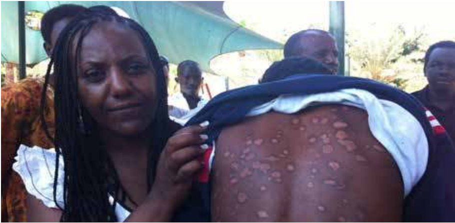
Figure 9: Sinai survivor with torture marks from plastic dripped on his back

In a desperate race against time, the Eritrean community living in the diaspora has managed to raise $41,000 demanded by Bedouin people-traffickers to buy the freedom of the girl's family.