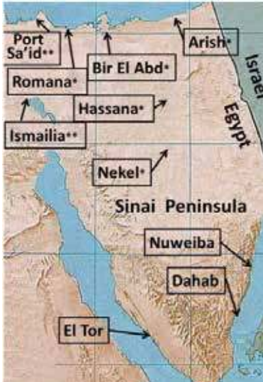
Figure 4: Map of Sinai Peninsula (Map: America Team for Displaced Eritreans 2013)

In the prisons it is the Sinai survivors who are criminalised, not the traffickers. In the detention centres and prisons the refugees live in very poor conditions, with very little food, no beds and no basic facilities. They only have access to very basic medical care. In such conditions they are still robbed of their freedom. They continue to have to pay to get phone time to collect their money and they are still collecting money to try and get out of detention. The soldiers profit from the little illegal trading that the refugees have to do to plan for their future.