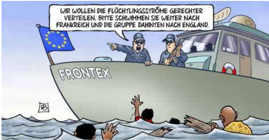
Figure 8: Caption (English translation): We want to distribute the flow of immigrants more equally. Please continue swimming to France and the group in the back to England. (© Harm Bengen, www.harmbengen.de )

In the past, Frontex has been heavily criticised, initially in relation to the HERA operations they conducted on the request of, and in cooperation with, Spain. 306 These joint operations (in which Spain, Italy, Portugal and Finland participated) were coordinated by Frontex and took place in the territorial waters of various African states to prevent illegal migrants from trying to reach the Spanish Canary Islands by preventing them from leaving the territorial waters of the African states. When these migrants were intercepted, they were ‘escorted’ by Frontex back to the African mainland and handed over to the authorities of those countries, even though such practices are prohibited under EU fundamental rights principles. 307 The migrants were, thus, prevented from applying for asylum and they could not appeal the decision to refuse entry, if such a formal decision had been made at all. 308