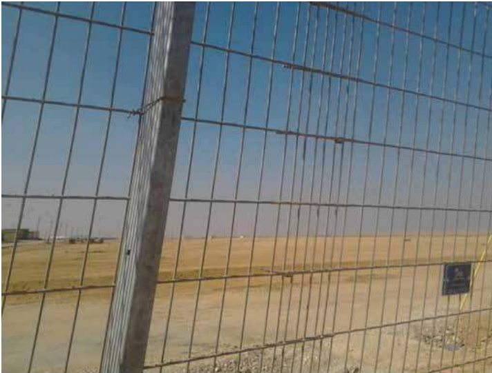
Figure 6: Open facility at Sadot, Israel (Photograph: Sigal Rozen, 21 November 2013)