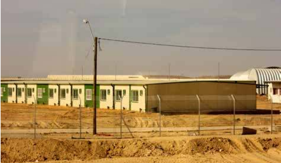
Figure 5: Open facility at Sadot, Israel

It is still unclear how it will be decided who will be sent to this new open facility at Sadot, but those that the authorities will want to transfer to the open facility will not receive permits to stay and will not be allowed to work. The facility will provide them with food, shelter and medicine. Once they are jailed, the refugees will be encouraged to leave 'voluntarily'. Those who violate the conditions in the open facility (for example, not show up to one of the three daily roll calls in the camp) will be imprisoned in a closed facility. Sadot is located in the desert.