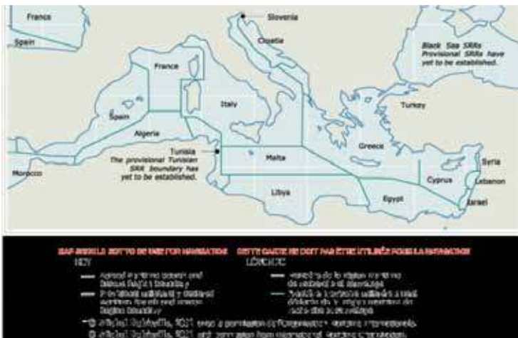
Figure 7: Map of SAR Zones in the Mediterranean Sea 290

In accordance with the SAR Convention, the seas are divided into search-and-rescue zones (SAR zones), each with its own coordinating party. This party provides and organises search and rescue services in its SAR zone. The Mediterranean is divided as follows: