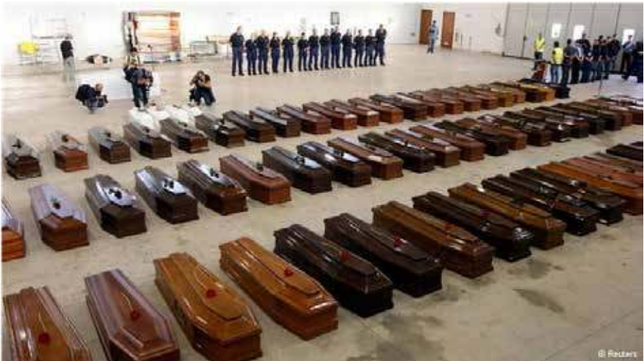
Figure 10: Lampedusa boat tragedy victims