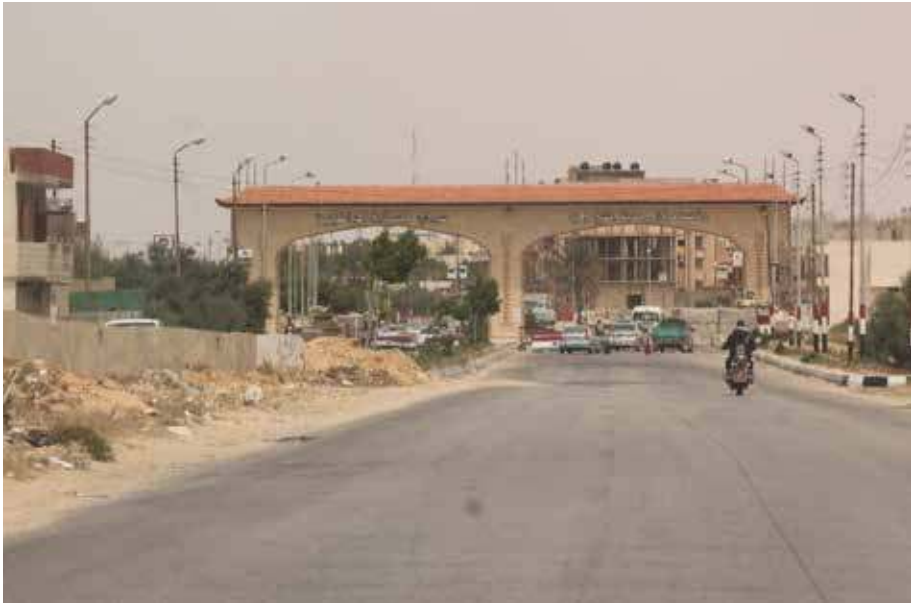
Figure 1: Checkpoint in Sheikh Zuweid, Sinai

On the other side of the Suez Canal there are cars waiting to drive them to the Sinai. They then drive north to Arish, the capital of the Sinai. They enter Sheikh Zuweid, which is where the lawlessness part of the Sinai starts, and then move further to Almahdia. From Almahdia, they travel all the way to the Raffa area, close to Gaza and the Israeli border. This is where the torture camps are located. There are many checkpoints on the way, and the cars with the hostages are easily identifiable. Pictured here is the last checkpoint, which is in Sheikh Zuweid.