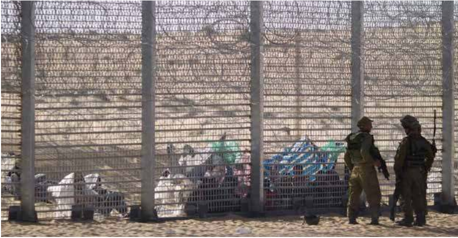
Figure 2: Sinai survivors and refugees on the Egyptian side of the Israel-Egypt fence

A heart-breaking testimony of what had happened by one of the two women was published by Rozen in 2012: