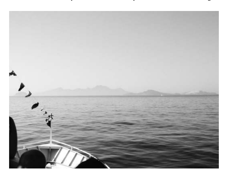
Island of Nísyros (considered volcanically active) viewed south from the Island of Kos; the island is approximately 8 km in diameter.

and regional experts. Although there is an obvious emphasis on the igneous rocks in the region, this is much more that just a synopsis of igneous rocks of Greece. This book is a template for using igneous petrology to dissect "the anatomy of any orogen"; I use it extensively in my volcanology class and refer to it regularly for certain parts of my research. Although for these authors this book could have been titled "how we spent our summer vacation", that would just reflect my jealously having only had the great opportunity to visit a few of the Greek Islands, just when this book first appeared in my library last year. Georgia and Dave were doing anything but vacationing as this book reflects an immense amount of original research that they have done over the years. In fact, I used it as a guide to the few parts of the region I visited as nothing geological comes close to its detailed geology of Greece. After visiting the island of Kos (home of the father of modern medicine (Hippocrates) and Georgia's home island) on my way to the smaller active volcanic island of Nísyros, I immediately realized where Georgia