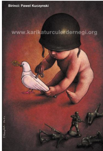
Figure 2. The caricature used for teaching semiotic analysis