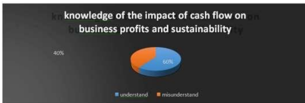
FIGURE 1 KNOWLEDGE POSSESSED OVER THE IMPACT OF CASH FLOW ON PROFITABILITY AND SUSTAINABILITY