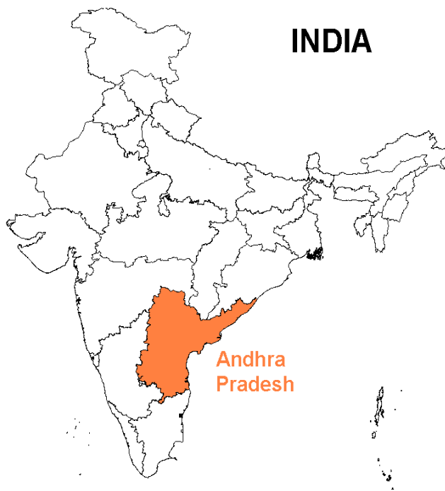
Figure 1a: Andhra Pradesh (AP)