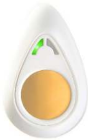
» Figure 2: The Pip biosensor

move in the system. Testing was carried out in such a way that the participant held the HTC Vive controller in one hand, and the Pip device in the other hand. Upon completing 2 minutes of free movement, the participant was asked questions related to cybersickness symptoms. The administrator recorded answers while the participants were still immersed in the VR environment, so that they did not need to take the headset on and off. In the same manner, each participant completed the survey after trying the other two locomotion speeds. The order of speed movements was randomized for every participant. The total test procedure lasted approximately 15 minutes per participant (which included a short introduction to VR, measurement of stress before immersion in VR, testing the movement speeds, and questionnaires). The immersion in VR and speed testing was about 9 minutes (three speeds, each tested for 2 minutes + answering questionnaires).