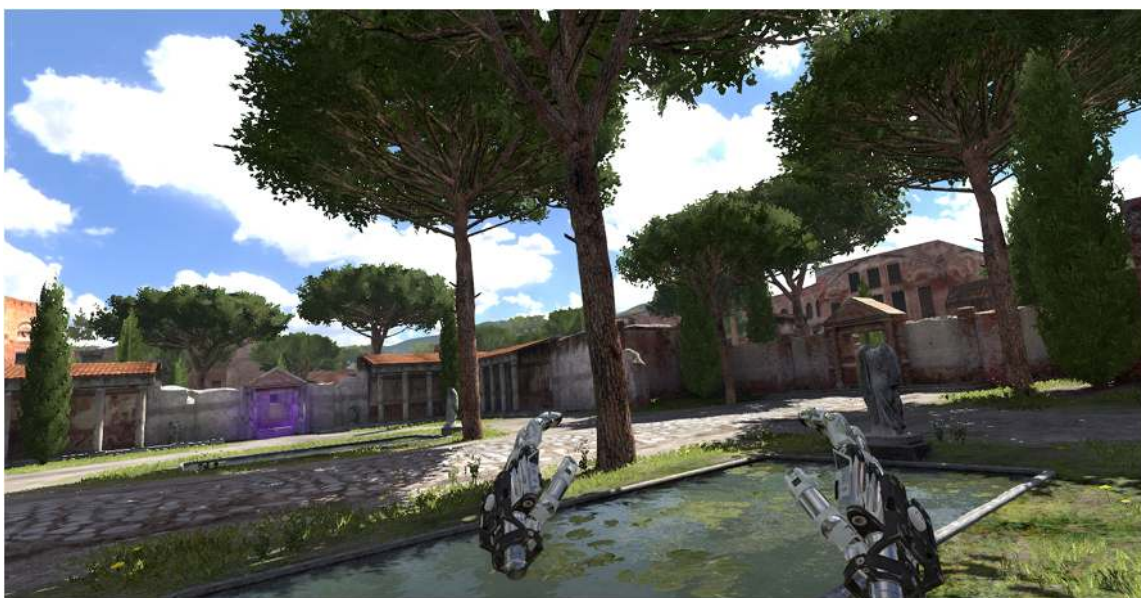
» Figure 1: Scenery of the Talos Principle VR game

The test procedure was as follows: first, the participant was seated, and their current level of stress was recorded with the Pip biosensor during a 2-minute time interval. The person was then asked general questions regarding their age, gender, and previous experience with VR. Afterwards, they were familiarized with the VR headset, and shown how to use the controllers to