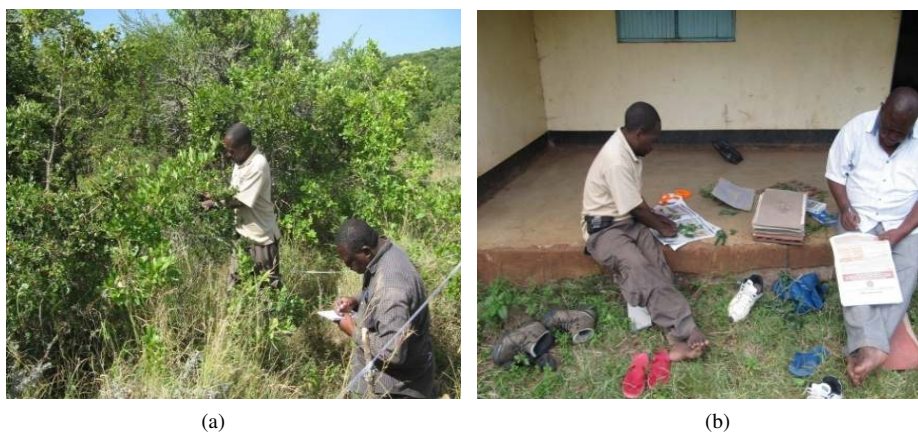
Plate 1. Photo showing (a) established study plot for vegetation sampling and (b) pressing unidentified plant species at Lerangw'a rangers post.

Natural tree species regeneration varied among areas with different grazing intensity, where the Least grazed