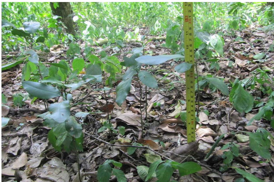
Plate 2. Regenerants in ungrazed areas (The seedling of Teclea simplicifolia ).