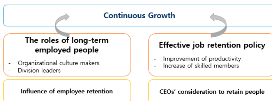
Figure 2. Conceptual framework of impact factors related to growth of business.

The literature review suggests that the factors influencing job retention are closely related. Job satisfaction influences job performance, job retention, and motivation. In this section, factors related to employee retention are discussed in terms of the roles played by long-term employees, the influence of employee turnover, CEOs' methods of retaining people, and effective job retention policy for the growth of the business. These complicated relationships are illustrated in the conceptual framework shown in Figure 2.