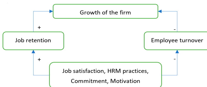
Figure 1. The relations between factors influencing employees' behavior.

The literature above provides evidence for a close relationship between job satisfaction and job performance. Many companies face job issues, such as job retention, employee turnover, management of high-performance people and HRM practices. The relationships between job satisfaction, HRM practices, employee turnover, job commitment, motivation and job retention are all important. Motivation is fundamental to retaining employees, and many job issues are essentially derived from motivation. This factor is psychological in nature, and it is necessary to consider a wide range of other relevant factors, such as family, communication, career and individual perspectives on business. Figure 1 shows a broad outline of the relations between relevant factors influencing employees' behavior.