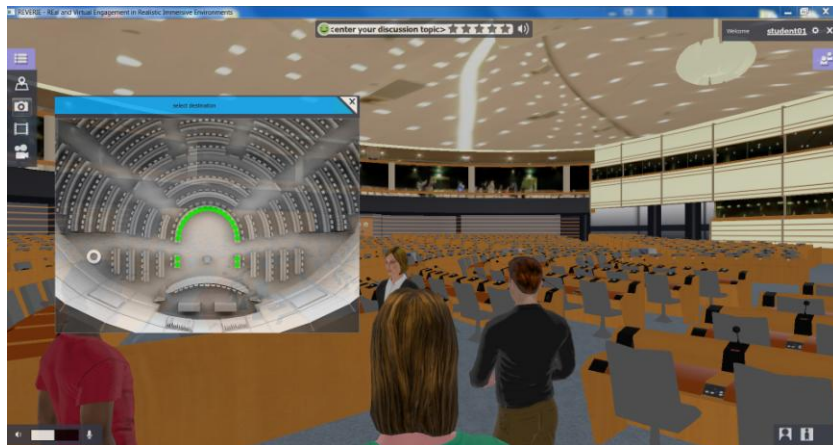
Figure 1: The REVERIE's Virtual Parliament educational scenario

We used the REVERIE framework (Fechteler et al., 2013) to implement an educational scenario which immersed participants in a guided tour of the virtual European Union (EU) parliament followed by an online debate session. In this role-playing scenario participants (in the role of teachers or students) interacted with each other and an Embodied Conversational Agent (ECA) to complete educational tasks designed to promote dialogic learning (Hajhosseiny, 2012).