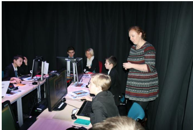
Fig. 3. One of the evaluation sessions in the laboratory

Four REVERIE researchers were present in the lab to record each session and to provide the necessary support (technical and logistical) for the successful completion of each session.