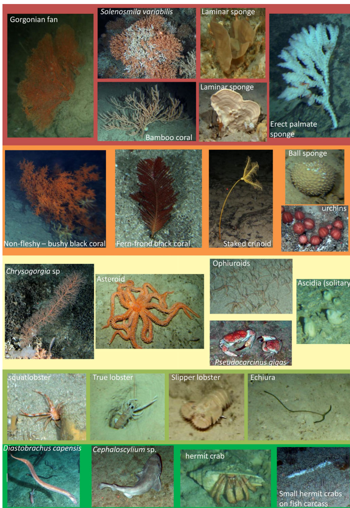
Figure 2. Example deep-sea fauna representative of the different sensitivity categories defined in Table 5 (red, highly sensitive; orange, intermediate; yellow, low; pale green, tolerant; dark green, favoured). The shape and form of taxa can vary widely, and these examples serve to show the sensitivity characteristics of deep-sea species.