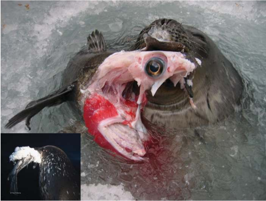
Fig. 2. A subadult Weddell seal with an Antarctic toothfish 1/3 its size in a research ice hole; the seal is removing the skin prior to severing the head from the body. Inset, a Weddell seal skinning and consuming the flesh from the tail of a large toothfish. Both photographs taken in McMurdo Sound.

1982), 44 stomachs inspected from McMurdo Sound (Dearborn 1965), and numerous scats inspected up to 1985 (Testa et al. 1985) and subsequently in McMurdo Sound (Castellini et al. 1992, Burns et al. 1998) and elsewhere (Plötz 1986). At four locations in East Antarctica, in a study that sorted 905 Weddell seal scat samples collected during 1995–97, one otolith was found (size not specified) of an Antarctic toothfish (Lake et al. 2003).