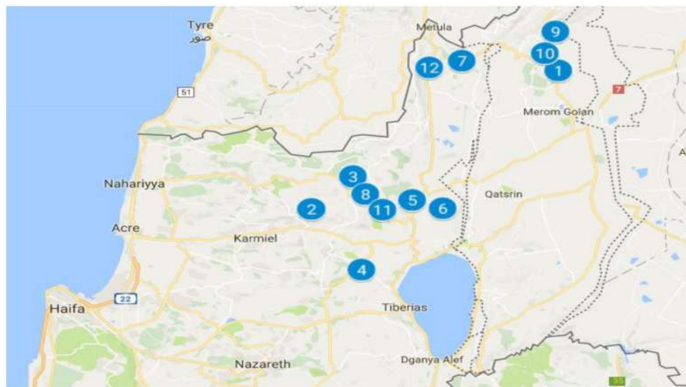
FIGURE 2 | Twelve towns in the Ziv Medical Center catchment area with the most road traffic crash casualties (Google Maps, 2017) 1- Buq'ata; 2- Beit Jann; 3- Jish; 4- Mughar; 5- Hatzor HaGiliit; 6- Tuba-Zangariyye; 7- Upper Galilee Regional Council; 8- Merom HaGalil Regional council; 9- Majdal Shams; 10- Mas'ade; 11- Safed; 12- Kiryat Shmona.

Table 2 shows that according to the Central Bureau of Statistics (22), towns classified as being of low socioeconomic