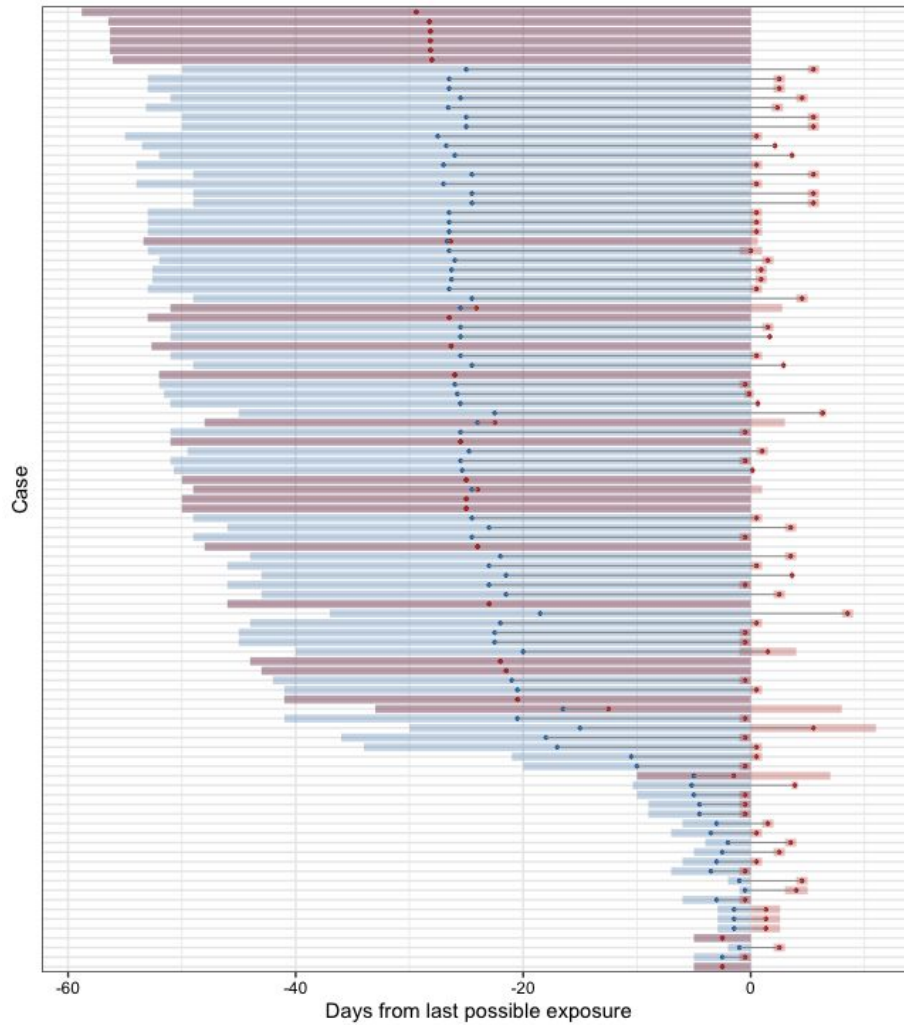
Figure 1. Novel coronavirus (2019-nCoV) exposure (blue) and symptom onset (red) times for 101 confirmed cases. Shaded regions represent the full possible interval of exposure and of symptom onset; points represent the midpoint of these intervals.