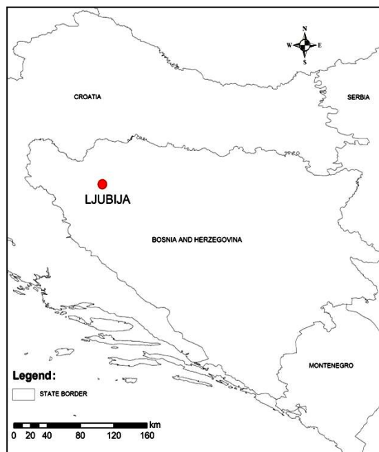
Figure 1. Geographical position of the Ljubija

Underground waters divide on upper or shallow waters, waters above water-impermeable layers and artesian waters. Upper waters are waters in layer closest to the surface, in the aeration zone. At deeper plunge, waters gather themselves above water impermeable layers. At filtration through the ground layer, decreases the content which gives the color and content of microorganisms decreases as well, while the content of solutions increases. These waters are used for water supplying of rural areas (draw wells). For this paper's need, water was analyzed, from a source used by local population of Ljubija for water supplying.