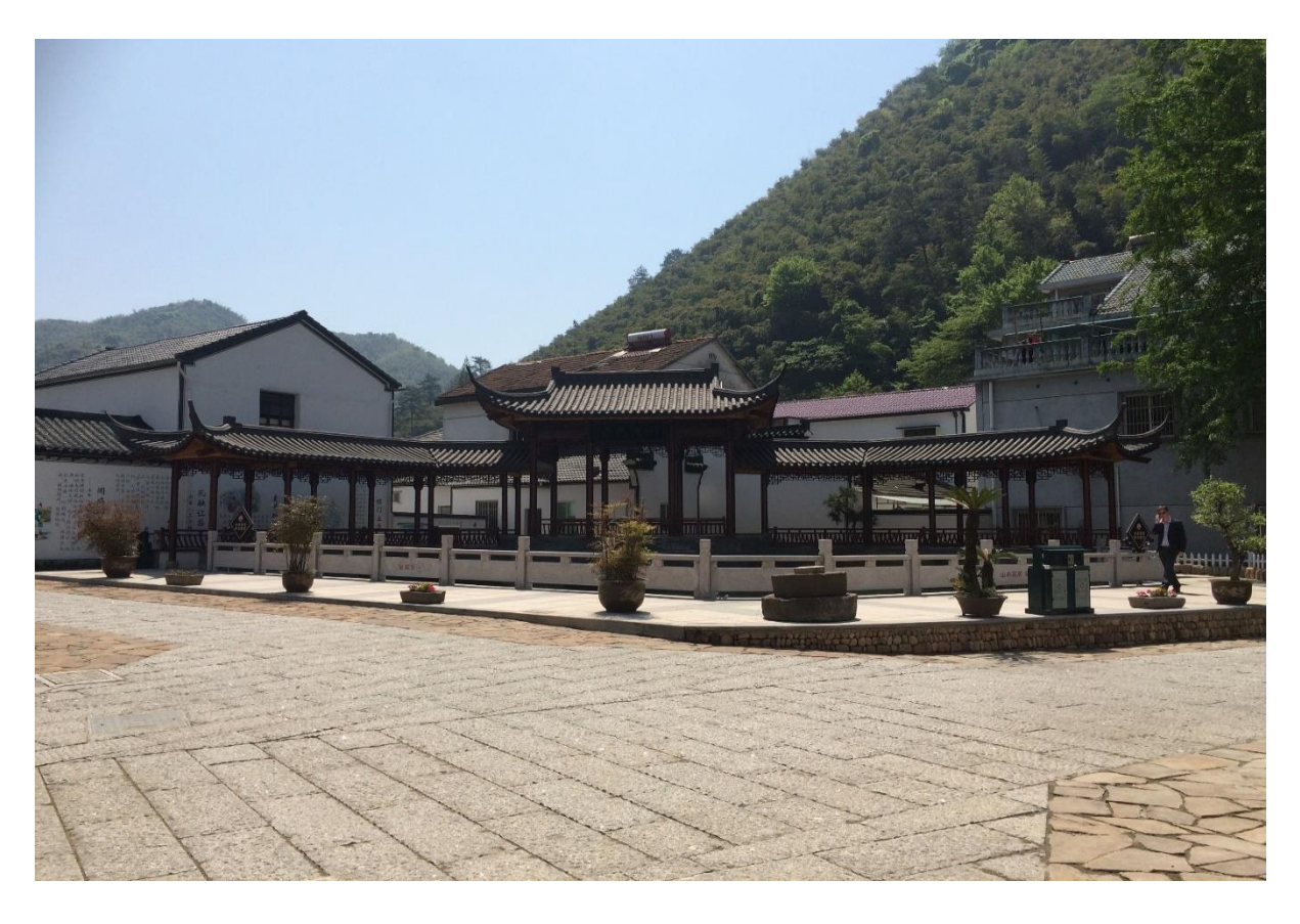
Changing Mindsets 2: Reconceptualising Heritage as Ecology

The process of changing mindsets was not just restricted to physical changes but also to the mental work of reconceptualising the nature of heritage within the context of CBV. CBV policies were primarily aimed at improving the ecology of villages, and the ability of officials to reconceptualise cultural heritage to fit within this context is a further example of adaptive governance. Just how ecology is understood as the underlying ethos of CBV is set out in the initial proposal from Anji in 2008, and the Zhejiang provincial plan that was published two years later. The policy documents contain three types of 'ecology': shengtai jingji (ecological economy); shengtai huangjing (ecological environment) and shengtai wenhua (ecological culture), with heritage having varying levels of importance in each of these areas.