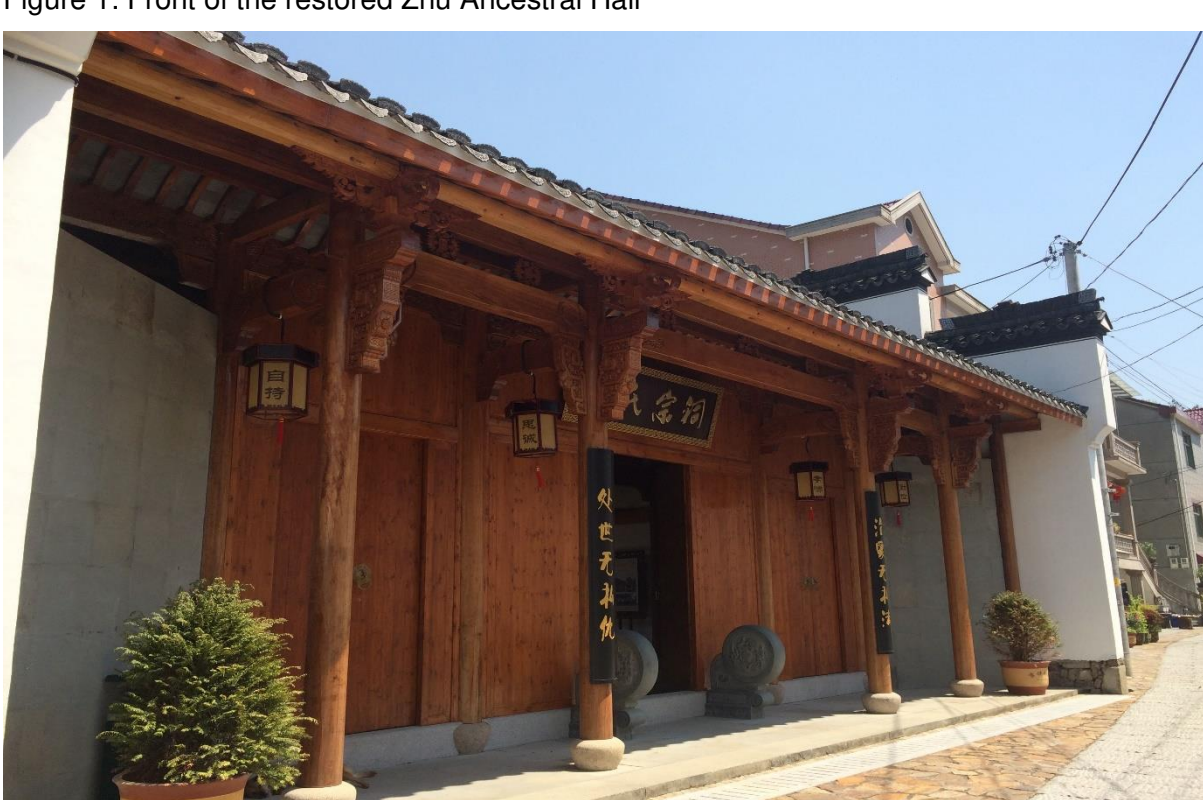
Figure 1: Front of the restored Zhu Ancestral Hall

Firstly, the Zhu Ancestral Hall and the historic cobbled paths were restored in line with this philosophy. The re-use of the Zhu Ancestral Hall as a museum is one tangible outcome of the gradual development of heritage as a central part of CBV, the potential value of which was recognised by official A in 2012. Whilst many ancestral halls have been museumified, (Svensson 2006, 19-20) this was carried out to achieve the status of premium model village. Now, adorning the walls of the Zhu Ancestral Hall are exhibition boards that relate the village's history, with cases displaying important documents, such as records of genealogies, and manuals on bamboo production. The exhibition projects the history of the village outwards, and is designed to showcase its uniqueness, its beauty, and the achievements of its people. It certainly displays the AHD by emphasizing the changes in the village under Communist rule, especially since the beginning of the Reform Era, downplaying the impact of the Great Leap Forward and the Cultural Revolution, and highlighting key figures such as party secretary Zhu Yuenian, who brought the village national recognition as a centre of bamboo production throughout the Maoist era.