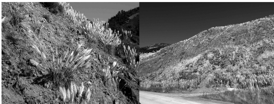
Fig. 3. Cortaderia jubata (Pampas grass) growing along severely eroded road cuttings in coastal areas of California, USA. This apomictic South American species establishes under very high disturbance frequencies that native species cannot tolerate. When herbicides are used to kill C. jubata , more erosion follows precipitating further invasion.

Global increases in international trade and changes to trading routes will bring new species to different areas (Hulme, 2009), and demands of industry for different plant types will ensure that species with a increasing variety of life history traits are introduced. Even tropical forests, which are typically considered more resistant to invasion than other ecosystems, are likely to experience increased numbers of alien species as forestry practices shift to planting shade-tolerant alien species that can persist in lower light environments characteristic of late succession (Fine, 2002). If the propagule bias towards early successional species is reduced in the future, many more alien species will be able to occupy late successional stages and the potential for new negative impacts will