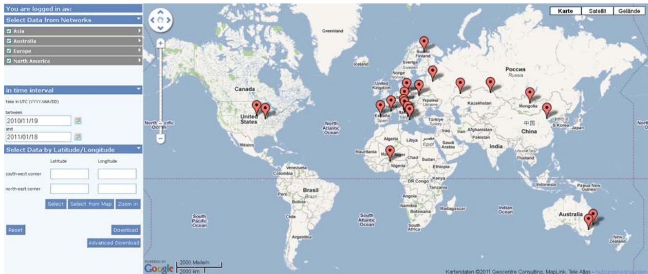
Fig. 2. Web interface of ISMN. Red droplets indicate the center coordinates of the different networks contained in the database (Status as of May 2011).

availability and quality of the data (Fig. 3). Apart from the map-based selection, the graphical data selection can also be refined by selecting continent, network, latitude/longitude, and time period. Finally, an advanced download window offers the possibility to make any query in the database based on SQL syntax.