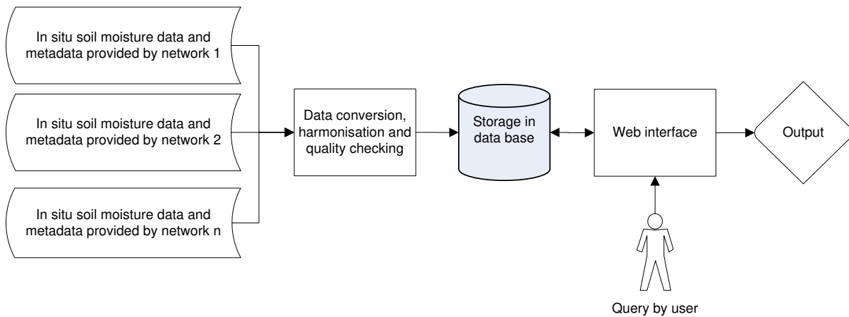
Fig. 1. Conceptual overview of ISMN.

The last two items are presented in this section, whereas data harmonization and quality control are discussed in Sects. 3.3 and 3.4, respectively.