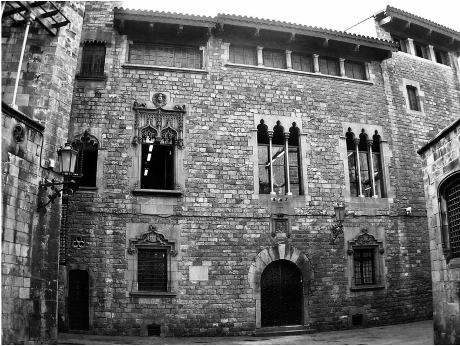
Figure 2. Canonical House reconstructed by Jeroni Martorell (1930).