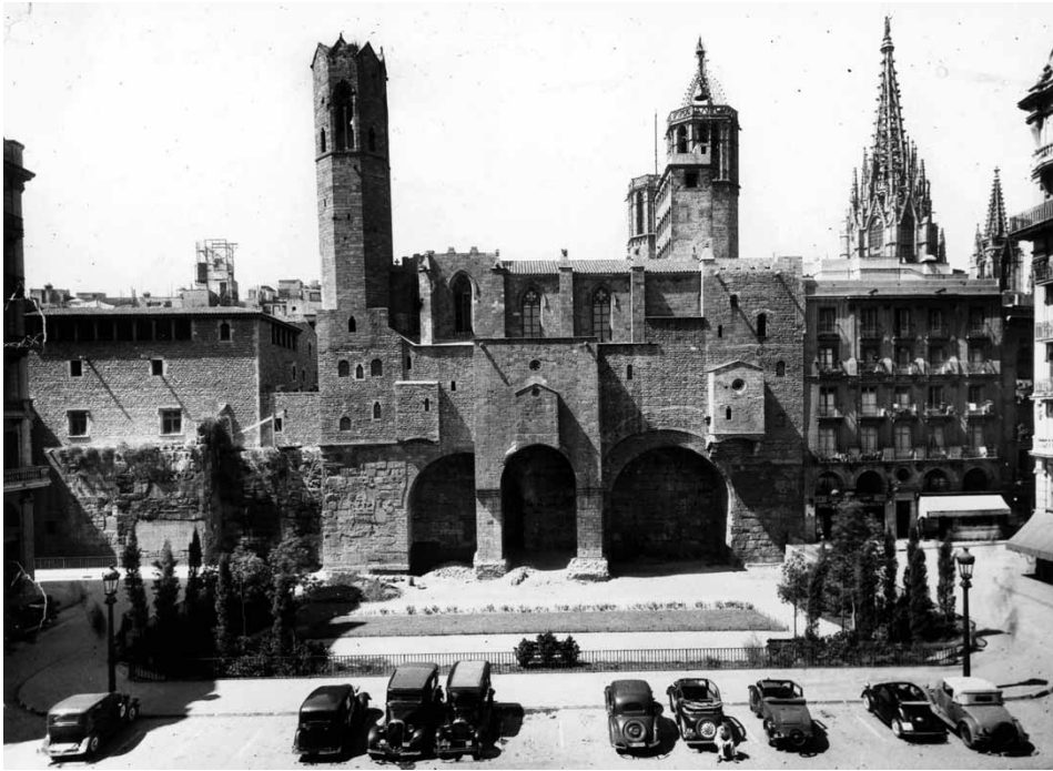
Figure 4. Posterior facade of the Royal Palace. On the left, the relocated Padellàs House and on the right, a nineteenth century residential house, 1943.