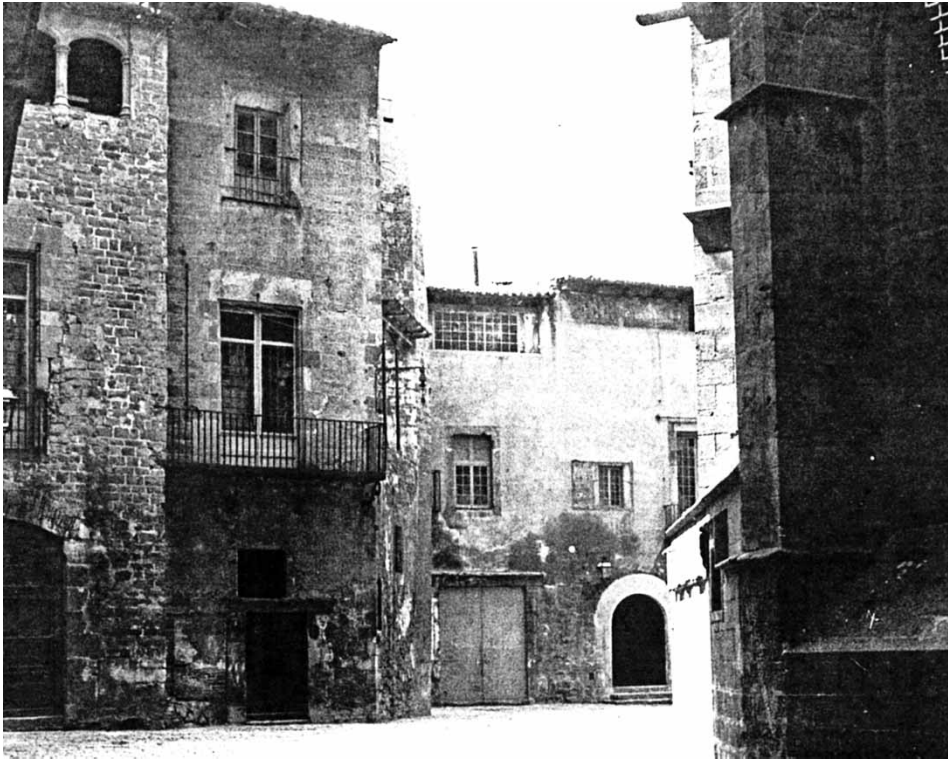
Figure 1. Canonical House before the reconstruction, 1927. This figure was published by the journal Barcelona Atracci3n , 1927, vol. 195.

received by the other buildings that it seems they were together for centuries' (Florensa, 1950, p. 630). During the re-location, elements considered missing were added such as a medieval window and a loggia. The work finished in 1943, and since then the building houses the City Historic Museum. At the same time, the whole Royal Palace was completely transformed between 1927 and 1955. Two additional residential houses annexed to the building were torn down and substituted by an ideal 'Catalan house' built with new materials. Historic doors, stairs and a coffered ceiling were re-located from other buildings, while 14 medieval windows, the most particular element of the idealised model, were invented (Figures 4 and 5). After the whole re-construction, the Royal Palace was declared by the state a 'historic monument' in 1962.