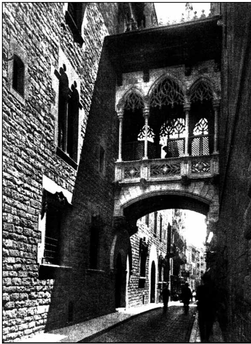
Figure 3. Neo-gothic bridge built in 1928. Picture published by Barcelona Atracci3n in 1934 with the title 'the ancient buildings of Barcelona'.