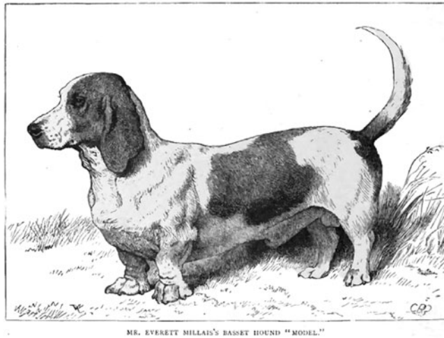
Figure 2. Vero Shaw, The Illustrated Book of the Dog (London: Cassell, Fetter, Galpin and Co., 1881). 'The illustration, by Mr C. B. Barber, ... is in our opinion, an exact representation of that well-known dog, whose name will never cease to be associated with the introduction of the breed into this country' (338).

The baton of championing the basset hound passed to Krehl, who had previously bred Irish terriers and bull dogs. He bought three Couteulx types at the Jardin d'Acclimation show in 1880: 'Pallas', 'Jupiter' and 'Fino de Paris', the latter becoming a much sought after stud dog (Figure 3). Basset-hound classes became a regular feature in National Dog Shows in Birmingham and the Kennel Club Shows at the Crystal Palace. 36 In a show in 1886 at the Royal Aquarium, over 50 basset hounds were entered, demonstrating that the breed had become popular with the dog fancy. 37 Indeed, some reports wondered if it would soon overtake its German cousin the Dachshund in popularity and there were attempts to introduced non-Couteulx varieties. For example, a French dog breeder, Monsieur Louis