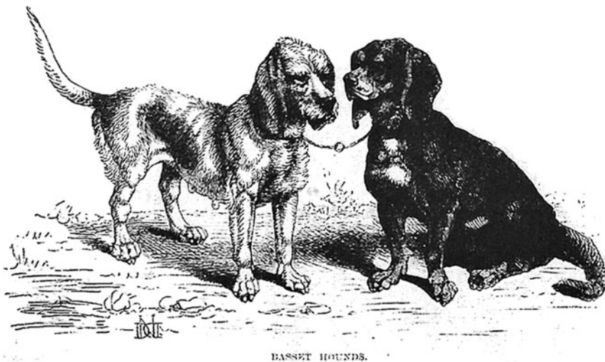
Figure 1. The Field , 1872, 40, 83.

The British invention of breed with a single standard, conformation type was quite different to the French notion 'des races de chien'.