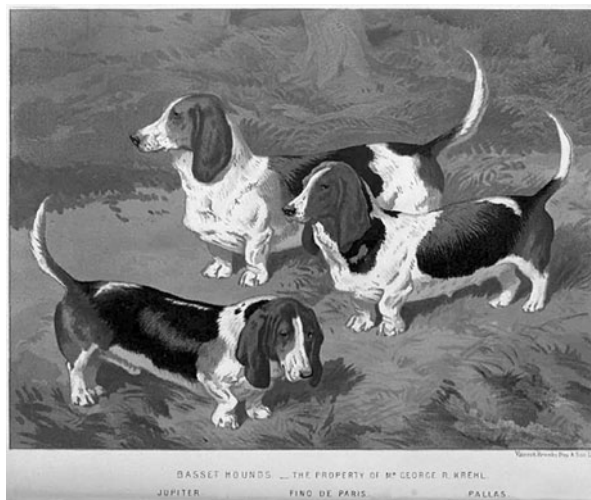
Figure 3. Vero Shaw, The Illustrated Book of the Dog (London: Cassell, Fetter, Galpin and Co., 1881), p. 337.

The baton of championing the basset hound passed to Krehl, who had previously bred Irish terriers and bull dogs. He bought three Couteulx types at the Jardin d'Acclimation show in 1880: 'Pallas', 'Jupiter' and 'Fino de Paris', the latter becoming a much sought after stud dog (Figure 3). Basset-hound classes became a regular feature in National Dog Shows in Birmingham and the Kennel Club Shows at the Crystal Palace. 36 In a show in 1886 at the Royal Aquarium, over 50 basset hounds were entered, demonstrating that the breed had become popular with the dog fancy. 37 Indeed, some reports wondered if it would soon overtake its German cousin the Dachshund in popularity and there were attempts to introduced non-Couteulx varieties. For example, a French dog breeder, Monsieur Louis