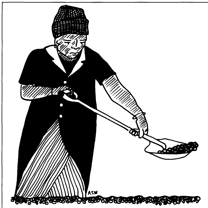
Reproduced by permission of the International Women's Tribune Centre. Artist: Anne S. Walker

Yet the consequences for micro and macro policy planning are immense. While dung can be a replacement fuel for scarce wood, and therefore ease the rate of deforestation, this use is a major loss in terms of soil conservation and fertility. For example, it is estimated that in Nepal eight million tonnes of dung are now burnt each year, equivalent to one million tonnes of foregone grain production (World Bank). At the same time, the use of dung as a fuel is a major instance of import substitution, and is a national saving in terms of the debts that would be incurred through the importation of fuel if resourceful women had not processed the alternative.