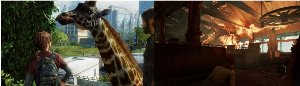
Figure 4: A return of hope juxtaposed to Ellie's previous encounter with David and the burning cabin resort as a symbol of her inner life.

In the course of the journey, Ellie discovers the new and to her unfamiliar world. She thus assumes a position similar to the player's, to whom this world is also strange, and constantly reminds Joel (and consequently the player) of nature's beauty. This manifests itself in various conversations in which she interrogates Joel about the ancient world and also in her curiosity of nature's many wonders. Especially noteworthy here is her treatment of animals which is tender and full of juvenile enthusiasm and that culminates in one of video gaming's most memorable moments. Having experienced several setbacks and the torturous encounter with David, Ellie is frustrated and lacklustre. She seems to have lost hope, but is awakened by a magnificent event. Leading Joel the way, Ellie discovers a herd of giraffes, which after the breakdown of civilisation now freely roam the lands (a scene reminiscent to the return of animal life in Richard Matheson's I am Legend (1954)). The player is now given the chance to express compassion by the option to pet the giraffe. In actualising this possibility, we take away Ellie's shyness to approach the animal and become affectionately involved in the events (what Calleja has called shared involvement (2011, 100ff.)).