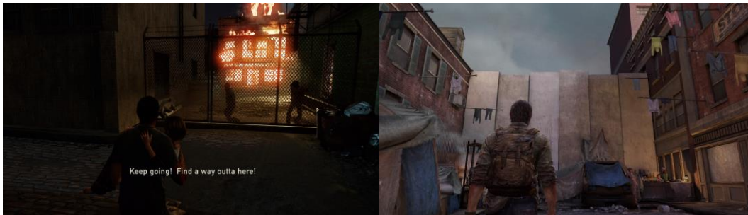
Figure 1: The city spaces in The Last of Us are characterised by an intense struggle and entrapment that manifests itself both physically and temporally.

Throughout the genre's history, utopian and dystopian fiction has often foregrounded the opposition between city and country (Jameson 2005, 143, 157). The city, thereby, as Jameson writes, occupies a continuum between Utopia and Anti-Utopia and cannot be allocated to either side (161). Instead, it enables a potential space for both utopian and dystopian deliberations, and oftentimes one cannot determine whether a recipient would deem a certain city utopian or dystopian (specifically considering the thrills of cyberpunk megapolises). In The Last of Us , conversely, the situation seems clearer. The city spaces of Austin, Boston, and Pittsburgh are marked by combat, violence, and panic and depict the dilapidated remains of an order that perished with the day of the apocalypse. As such, The Last of Us lets the player enact the official narrative as s/he directly witnesses an estranged place that, on closer inspection, seems alarmingly similar to her real world.