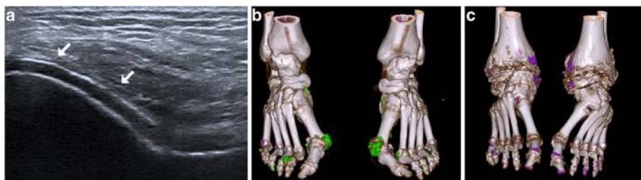
Fig. 1 Imaging of monosodium urate crystal deposition. a Double contour sign of intra-articular cartilage deposition of the femoro-patellar joint (arrows), (b) large (volume 5.39 cm 3 ) and (c) small (volume 0.02 cm 3 ) soft tissue volumes of deposits on the feet visualized with dual-energy computed tomography

with the DC sign out of 6 (median 2, interquartile range (IQR) 2–3). The volume of MSU deposits with DECT was 2.7 \pm 6.7 cm 3 for the feet (median 0.7 cm 3 , IQR 0.1–2.2) and 1.9 \pm 4.6 cm 3 for the knees (median 0.2 cm 3 , range 0–1.2) (Fig. 1). Correlations between SU levels and DECT volumes of MSU deposits of the knees, feet, and knees + feet were weak ( \rho = 0.28, 0.20, and 0.23, respectively). Overall, 28/42 patients presented with the metabolic syndrome and the average 10-year coronary event or stroke risk according to the ACC/AHA ( n = 33 ) was high ( 21 \pm 15\% ).