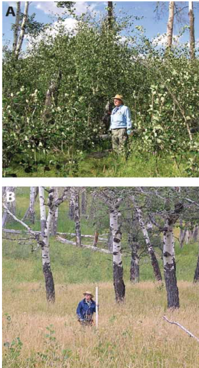
Fig. (2). August 2006 photographs of (A) recent aspen recruitment (aspen 3-4m tall) in a riparian area along Lamar River and (B) a lack of recent aspen recruitment (aspen <1m tall) in an adjacent upland. These differences shown in aspen heights were likely due to differences in perceived predation risk due to differences in escape terrain. (Ripple and Beschta 2007).

daily foraging decisions (Brown et al. 1994, Brown and Kotler 2004).