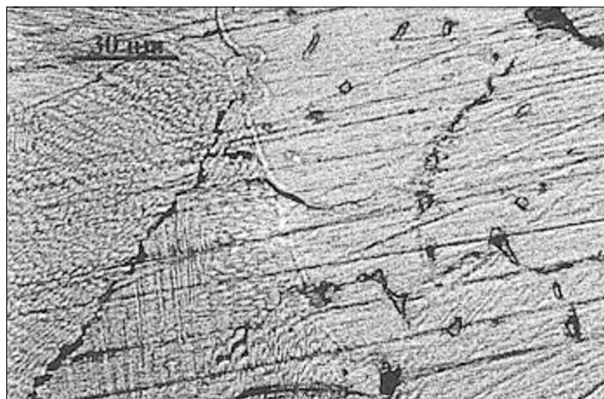
Fig. 3 Interface between welded area (left) and the cast alloy (Cs) showing the fine microstructure and the crack propagation along the grain boundary in the welded area.

The microstructure in the welded area is granular (about 300 µm for the mean grain size) and inside which there is a very fine cellular sub-structure with the same composition as in the initial alloy (Figure 3).