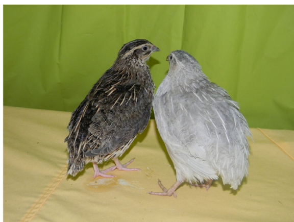
Figure 1 Wild-type (left) and lavender (right) Japanese quail.

All Japanese quail were produced and maintained at the INRA Experimental Unit PEAT in Nouzilly, France (Pôle d'Expérimentation Avicole de Tours, F-37380 Nouzilly, authorization B37-175-1, 2007) in accordance with European Union Guidelines for animal care, under authorization 37-002 delivered to D. Gourichon by the French Ministry of Agriculture. Animal procedures were